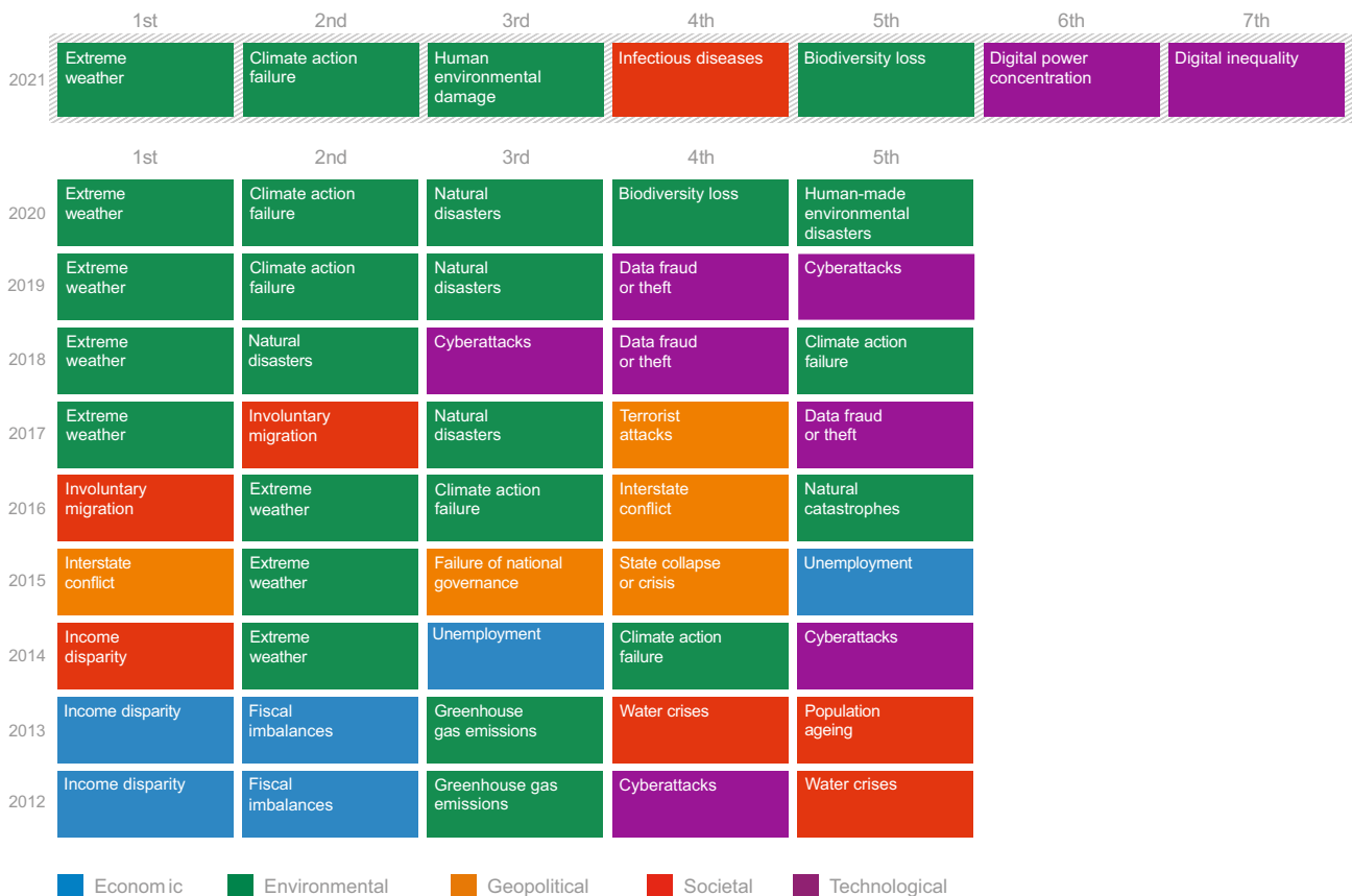
Top Global Risks by Likelihood