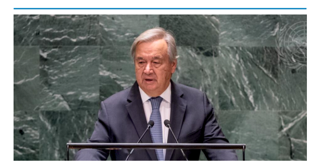
In these turbulent times, the work of the United Nations is more necessary than ever to reduce suffering, prevent crises, manage risks and build a sustainable future for all.