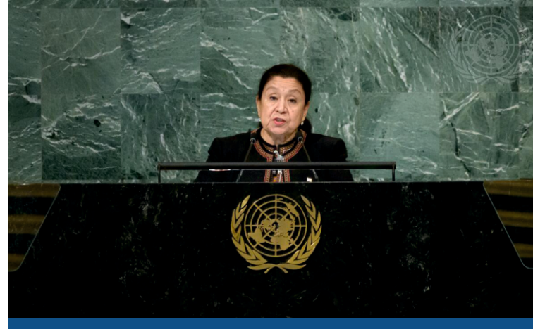
"We are particularly concerned about the currently growing threats to global food security, which are rapidly spreading to an increasing number of countries and entire regions"

Climate change and water. "In Central Asia, for objective reasons, climate change and water issues are the most important, and in some cases, determining factors in the development of regional processes,