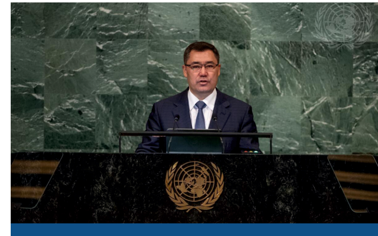
"Kyrgyzstan fully supports the UN as the only universal structure authorized by all of us – the member states of the UN – to solve the challenges faced by humanity"

Sustainable development based on own capacity. The Kyrgyz Republic is committed to the SDGs and