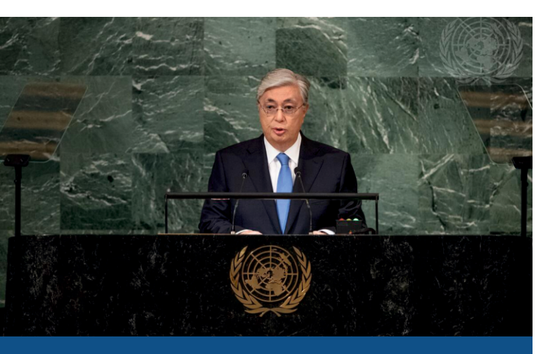
"Kazakhstan have pledged the total transformation of the oil-and coal-dependent energy sector into a net zero economy by 2060"

The world fell victim to a new round of conflicts. "The world appears to have entered a new, increasingly bitter period of geopolitical confrontation. The long-standing international system based on order and responsibility is giving way to a new, more chaotic and unpredictable one. The security architecture is eroding and mutual distrust between world powers is dangerously deepening. The world is falling prey to a new set of military conflicts. For the first time in two generations, we face the prospect of the use of nuclear weapons and not even as a last resort. New fault lines are creating artificial barriers and economic isolation."