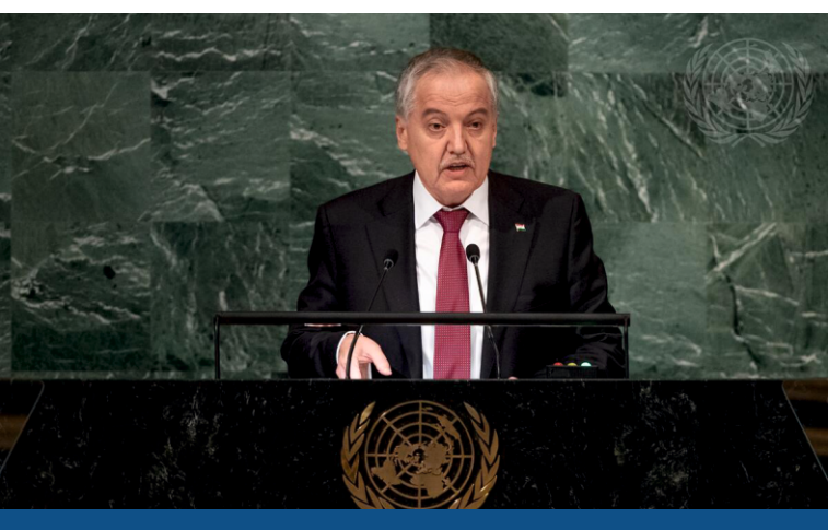
"The impact of climate change on water resources is another crucial topic that requires our concerted efforts"

Conference on Border Security. As the existing world order transforms, such threats as terrorism, extremism, drug and arms trafficking, cybercrime and other forms of cross-border organized crime have a tendency to increase exponentially. To further discuss the abovementioned issues, the Government of Tajikistan, the United Nations Office of Counter-Terrorism and its partners will be holding a High-Level International Conference "International and Regional Border Security and Management Cooperation to Counter Terrorism and Prevent the Movement of Terrorists" in Dushanbe, Tajikistan on October 18-19.