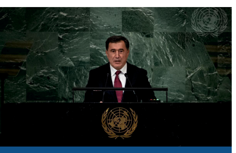
"We are ready to actively participate in multilateral efforts to promote topical issues of the green agenda and curb climate change processes."

Strengthening trust. "The world today is facing a deep crisis of trust at the global level, an intensification of numerous challenges to stability and security, growth of geopolitical confrontation and increase of risks of bloc mentality. No country can avoid global risks and challenges or cope with them alone. Under the current conditions, we strongly believe it is important to strengthen the central role of the UN in addressing global and regional challenges. The UN should evolve to respond effectively to transformation taking place. The establishment of inter-civilizational and inter-cultural relations and dialogue is also extremely important in finding the coherent approaches and solutions, relieving global tension, uncertainty and unpredictability. With this in mind, at the Shanghai Cooperation Organization Summit in Samarkand on September 16 the President of the Republic of Uzbekistan Shavkat Mirziyoyev put forward the Samarkand Solidarity Initiative for Common Security and Pro-