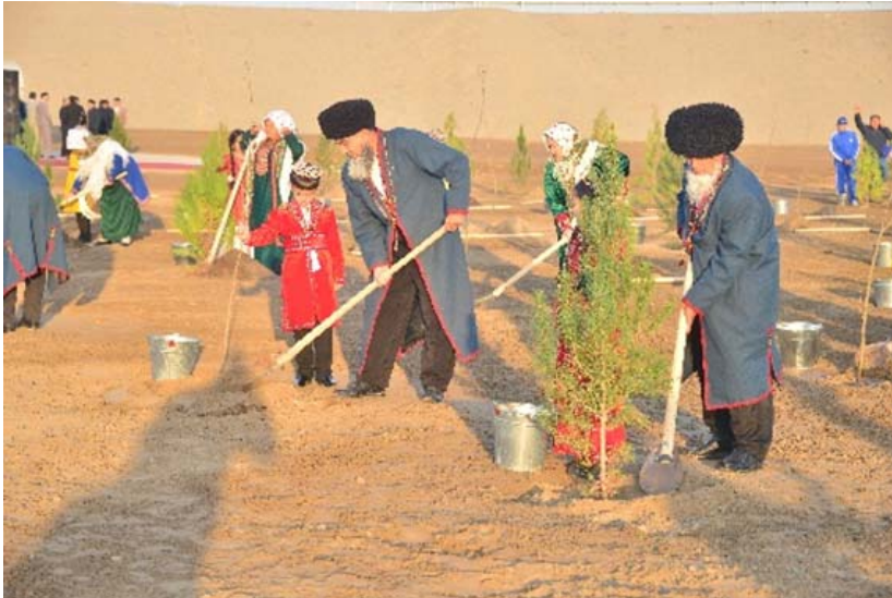
In the framework of River Day activities up to 1500 trees were planted near Turkmenabat