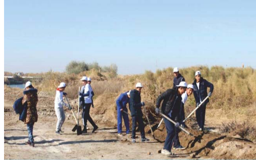
School children cleaning along Amudarya River in Urgench District