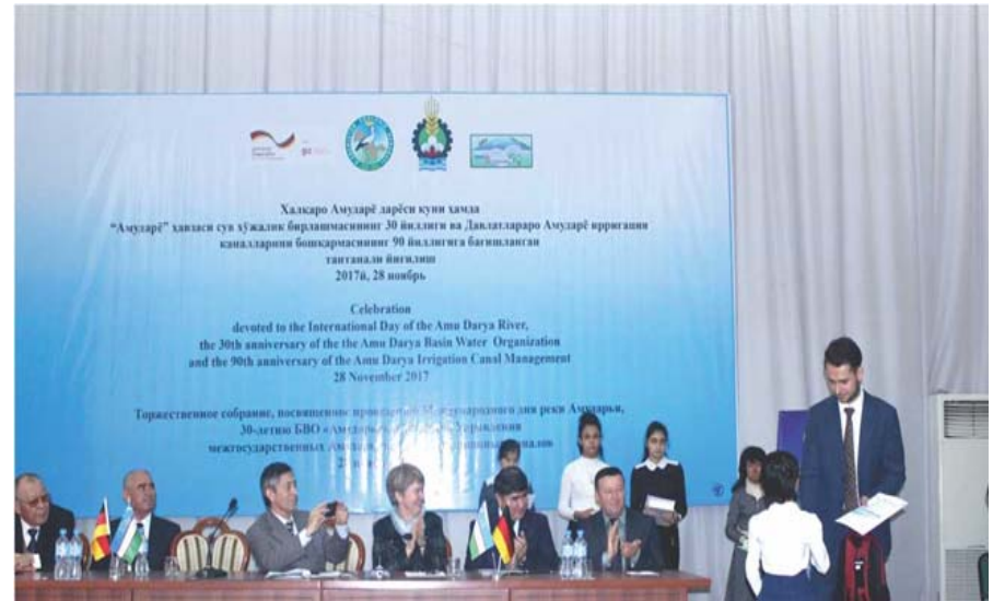
Photo and drawing completion has been held on topic “Amudarya river before and today”