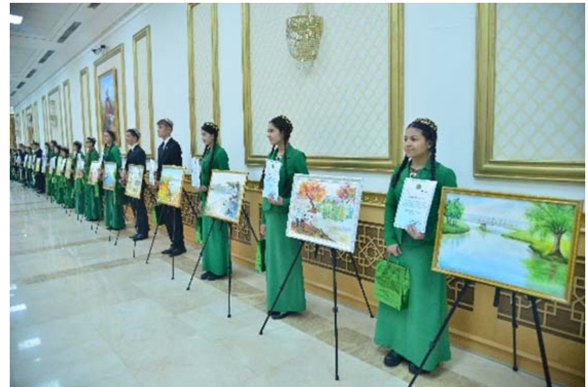
Students from 46 schools of Lebap province participated in school drawing competition