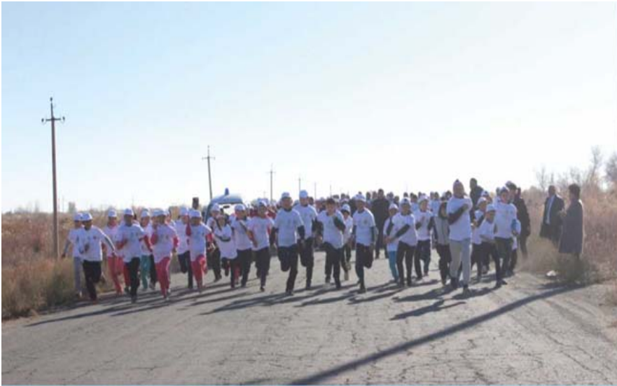
School children from Urgench participating in the marathon between two water installations along the Amudarya River during celebrations