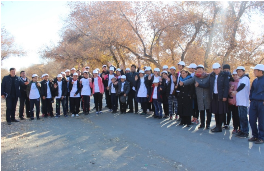
School children from Urgench participating in excursions to water objects