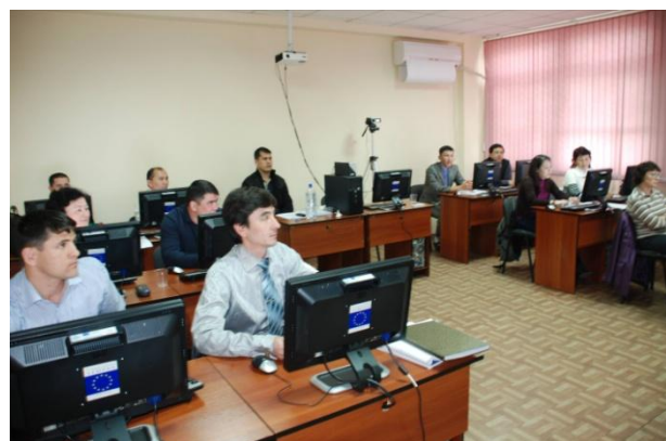
Training on databases and Geographic Information System (GIS)

In order for these institutions to effectively fulfil their mandates, assistance is provided to develop long-term basin plans and these then serve as the basis for introducing IWRM principles.