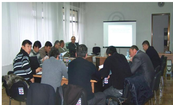
Coordination meeting with partner water management organisations

Furthermore, the database will form part of the reporting system for water management organisations and replace the current outdated manual reporting system. It will also serve as a model and methodology for these organisations to systematise their data. Nationally, partner water agencies will handle database roll out and adoption.