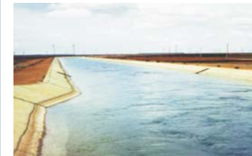
Canal in the concrete channel

Showing you, dear colleagues, new forms of water management and making them an important for your day-to-day practice - is one of the main tasks of the Training Center.