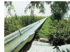
Ditch irrigation network

In order to reach this purpose many tools were created in cooperation with water experts from five states, such as regional information system and database, models, agreements. Our trainees learn how to apply these tools during workshops.