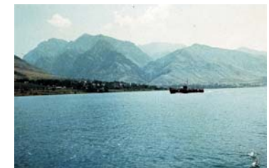
Charvak storage reservoir