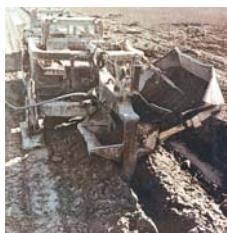
Mechanized construction of horizontal drainage

Our reserves in water saving are very big. Let us compare the following data. In Israel unit water discharge per 1 ha is equal to 5.6 thousands m 3 , while it is 57 m 3 per capita in public water supply. In the Aral Sea basin's countries, these are 11.9 thousands m 3 and 144 m 3 , respectively.