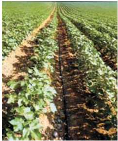
Drip irrigation of cotton

Water supplied in proper amount and in time to the right place is a great production force, an output of human labor with own cost and price. However, in majority of our countries the government compensates water cost because today water users are not able to cover this cost. You will get acquainted with the first steps made in this direction by Kazakhstan and Kyrgyzstan. The workshop will help you to compute and model options of transferring the compensation of water costs from the government to water user.