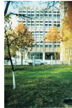
ICWC Training Center located in BWO "SyrDarya" building on the 4-th floor