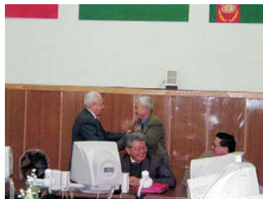
Awarding certificates to the graduates of the ICWC Training Center courses