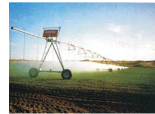
Irrigation systems of the Netherlands and Austria