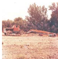
Levelling of the irrigated field