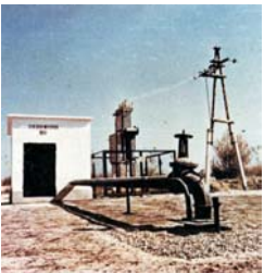
Vertical drainage well