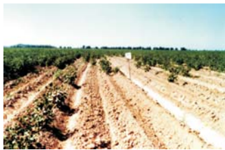
Saline part of the field