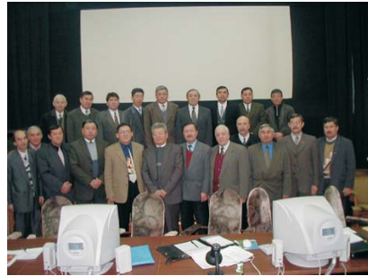
Trainers and trainees of the ICWC Training Center

Training Center also plans to create subdivisions in each state of Central Asia that will provide rapid extension of water experts trained on its methods and dissemination of the most valuable thing - world experience in water use and saving, and will include new training courses on environmental issues and water quality, water supply and fish production in irrigation systems, thus covering other water use sectors.