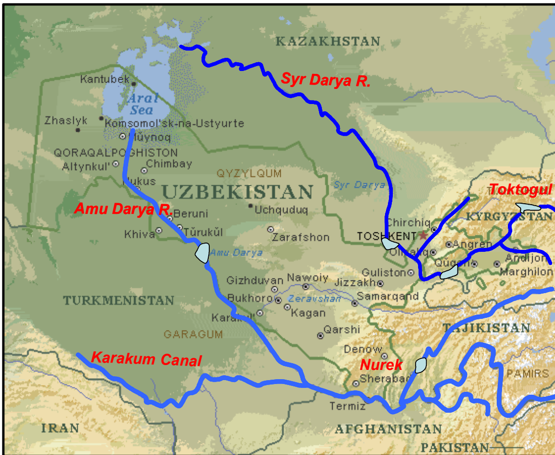
Figure 1. Map of Central Asia.