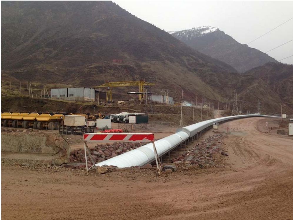
Part of the conveyer system for construction of the Roghun HPP