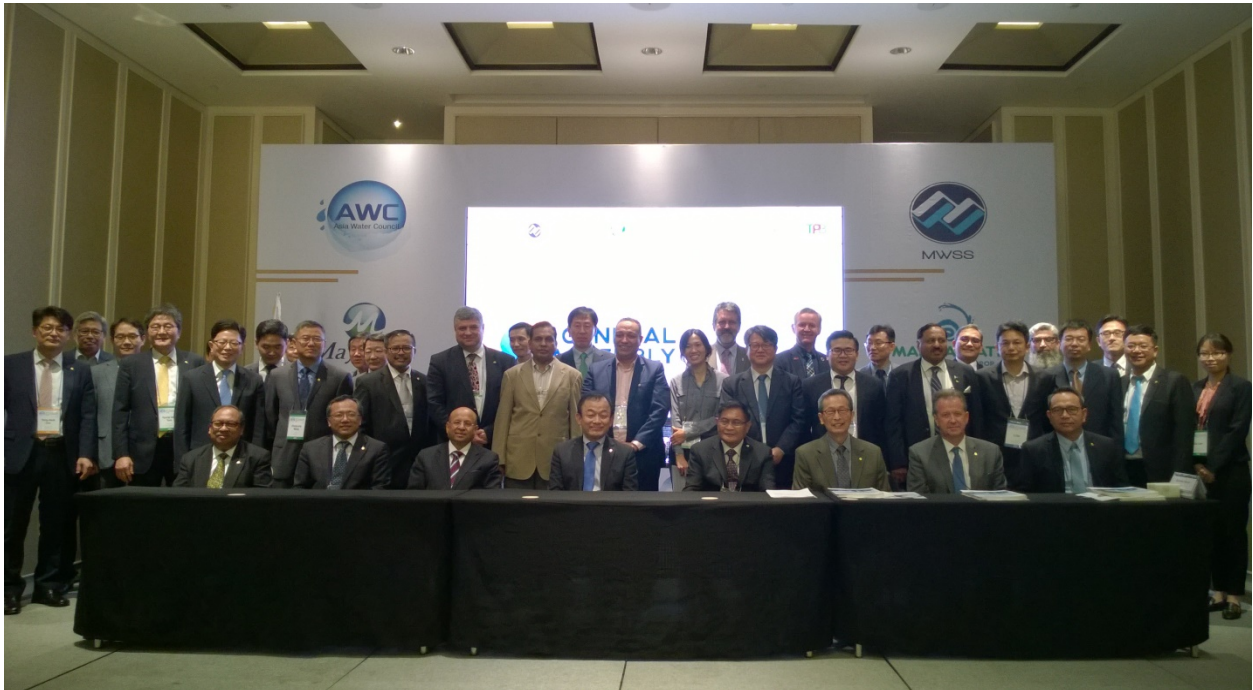
Participants of the 9 th meeting of AWC BoC (in the new composition)

On the second day, the 9 th meeting of the Board of Council (in the new composition) was held. Its agenda mainly focused on institutional matters.