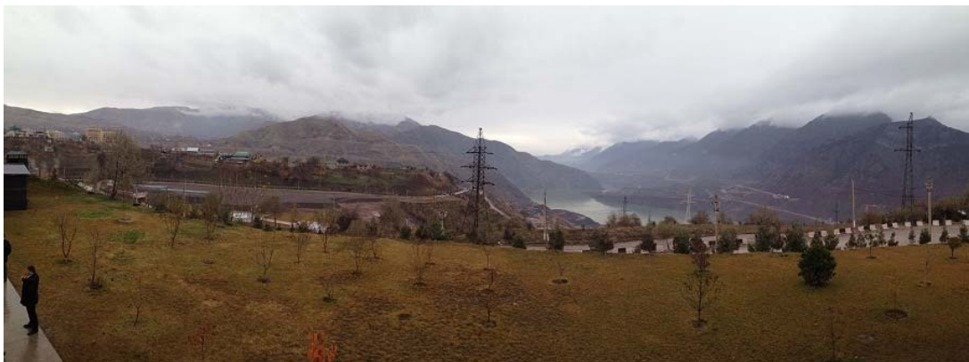
View over the future reservoir; water will flood the road on the left

A recreation zone is arranged around the reservoir to attract tourists in the future.