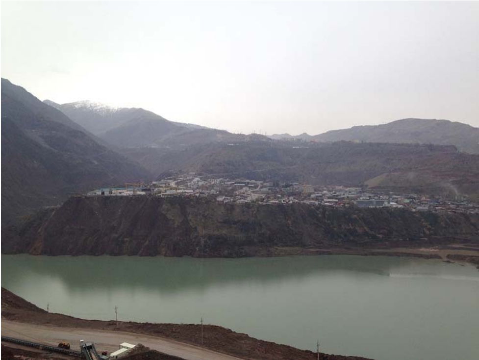
Beginning of the conveyer system