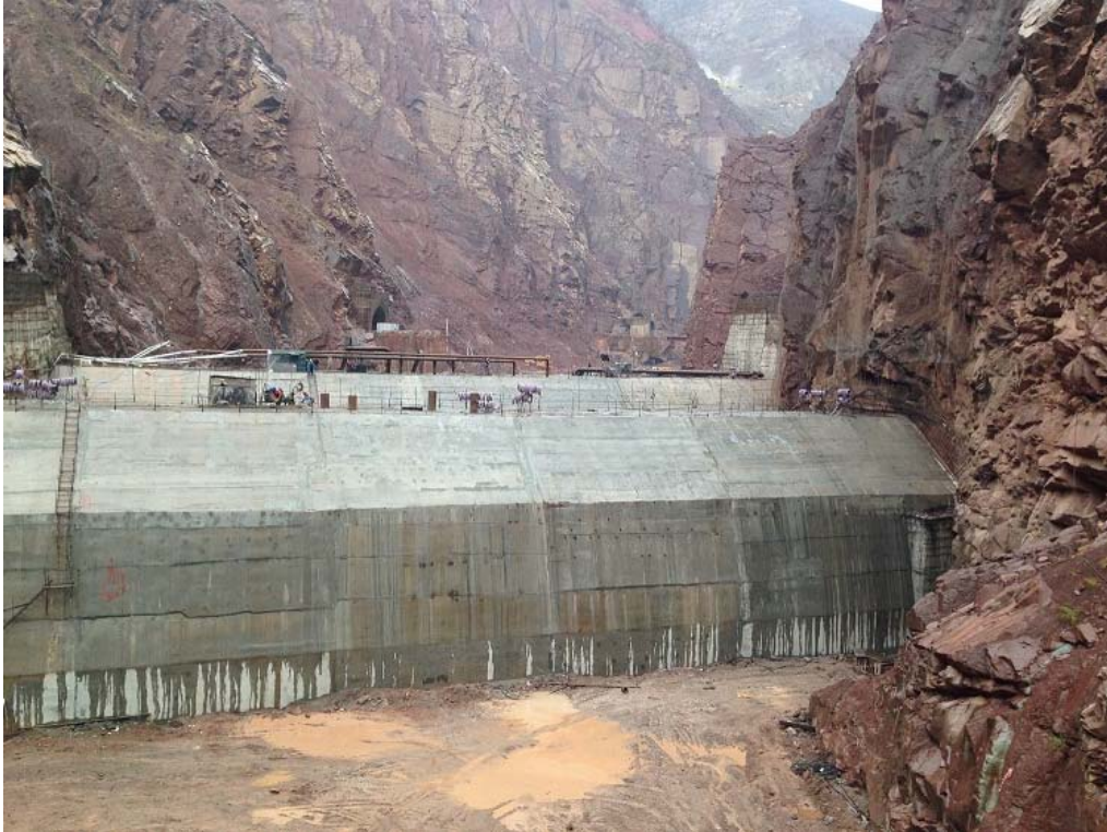
Core of the dam on the horizon