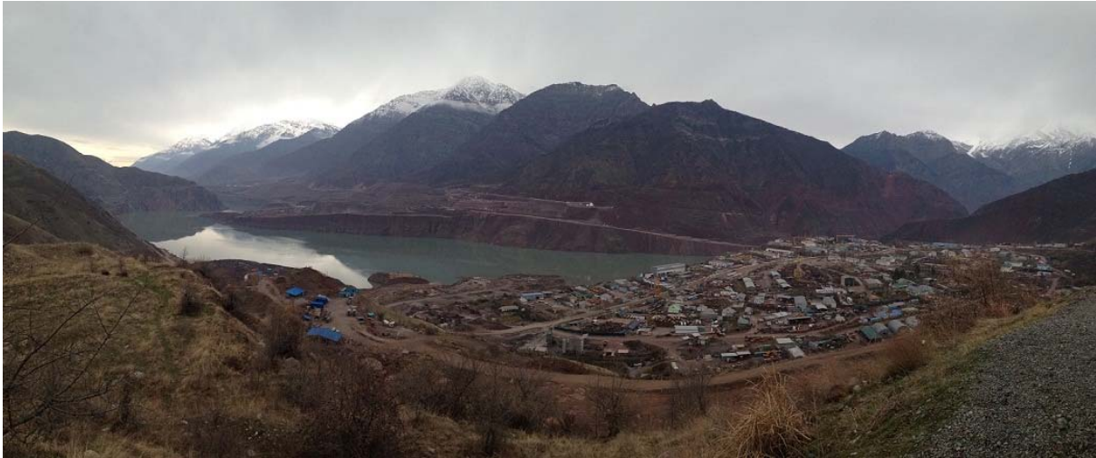
On the right, headwater created by temporary dam and the construction site, which will be flooded in the future

On 26 November 2016, the Vakhsh River was dammed. At the moment, the dam is erected out of 42 million tons of filling material, and the accumulated water volume is 254 million m 3 . Water is retained by a temporary dam. The construction is planned to be completed by 2027. The design normal reservoir water surface is to be achieved by 2032.