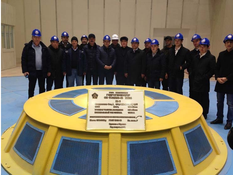
Aggregate No.6 launched on 16 November 2018