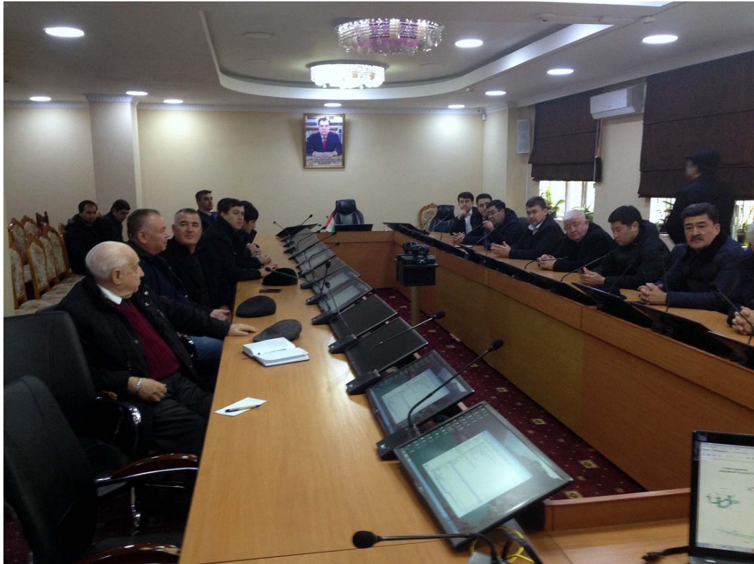
ICWC delegation at the office of OJSC Roghun HPP