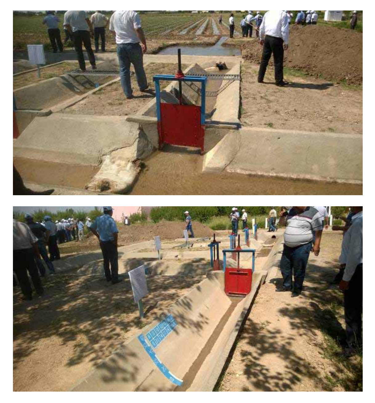
Training unit at farm level in the Nishan district