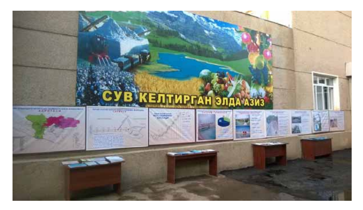
Demonstration materials for the participants of the workshop in the yard of Amu-Kashkadarya BISA