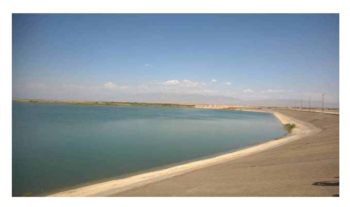
Kamashin reservoir along the Kashkadarya's tributary – Yakkabagdarya River. Total volume – 25 Mm<sup>3</sup>

The participants visited the Kamashin reservoir, where they became acquainted with operation of the set of facilities, as well as fish production in special ponds.