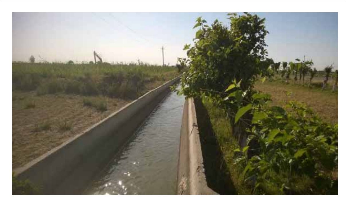
Ditches are effectively operated after routine repair and maintenance almost throughout the Kashkadarya province

During the next stop the participants were introduced with equipment, which is produced and sold by the "Uzmeliomashlizing" company, which was specially established under the Reclamation Fund. Samples of technical equipment were presented with demonstration of their technical characteristics, price and purchase terms.