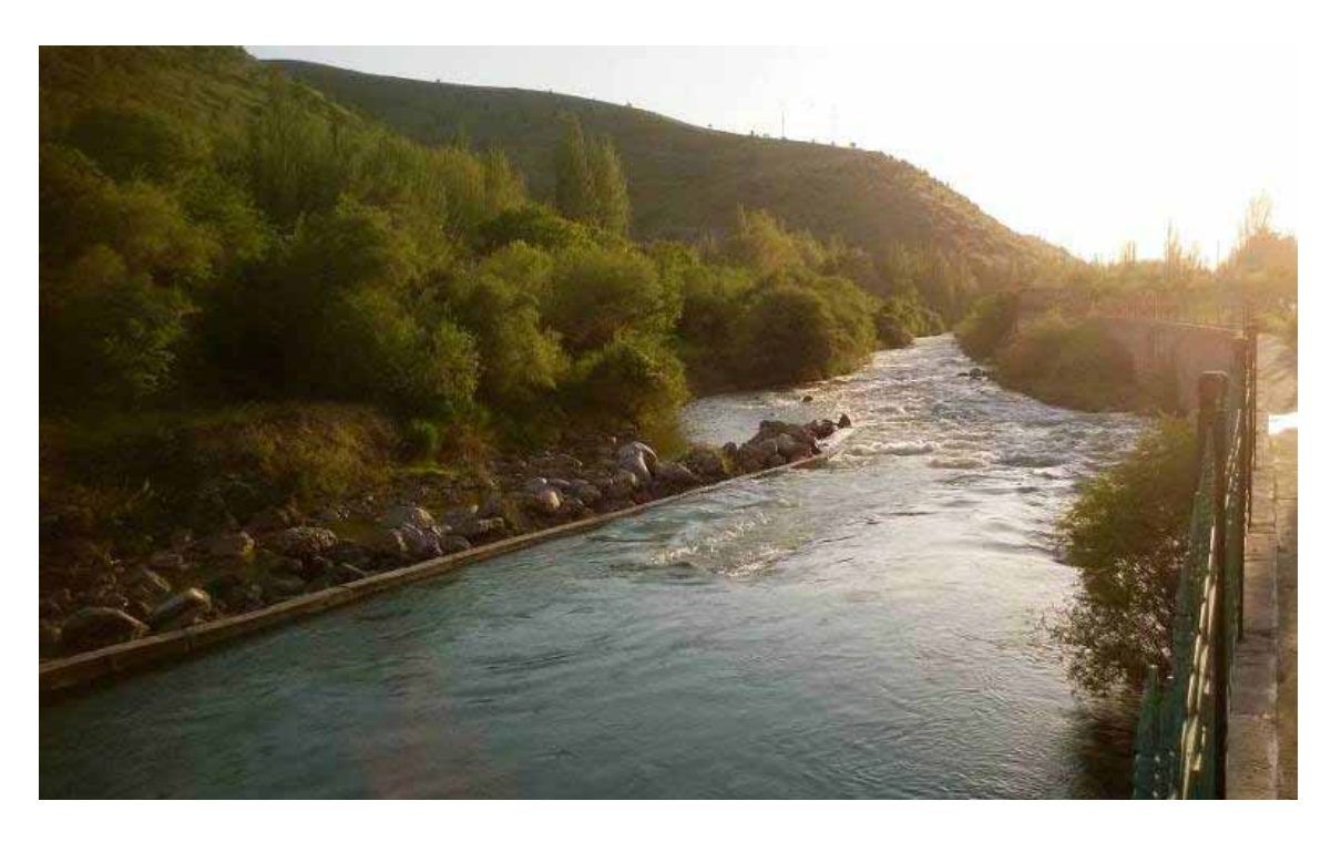
Diversion canal in tail race of the Gissarak hydroscheme

Deputy Head of SIC ICWC Sokolov V.I.