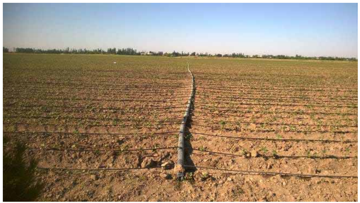
Drip irrigation system for cotton in Karshi district