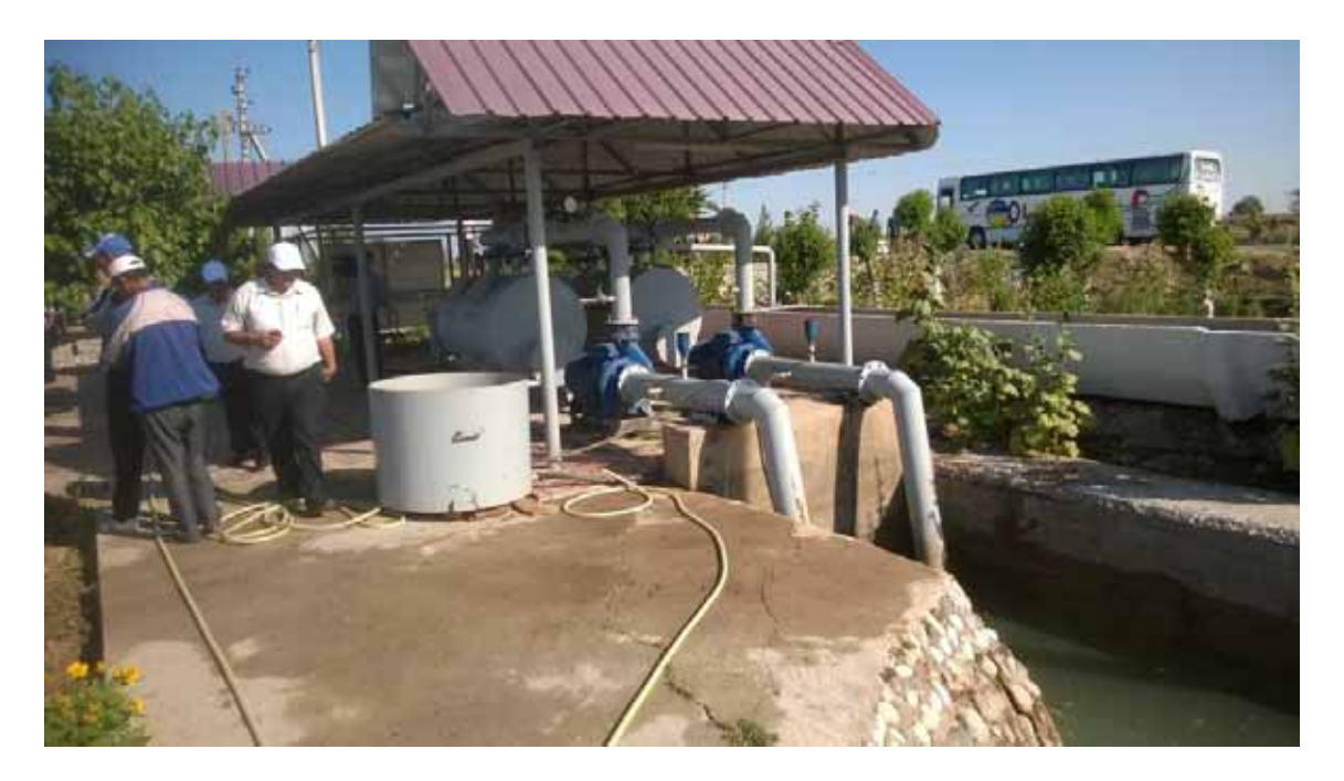
Pumping and filtering equipment for drip irrigation system