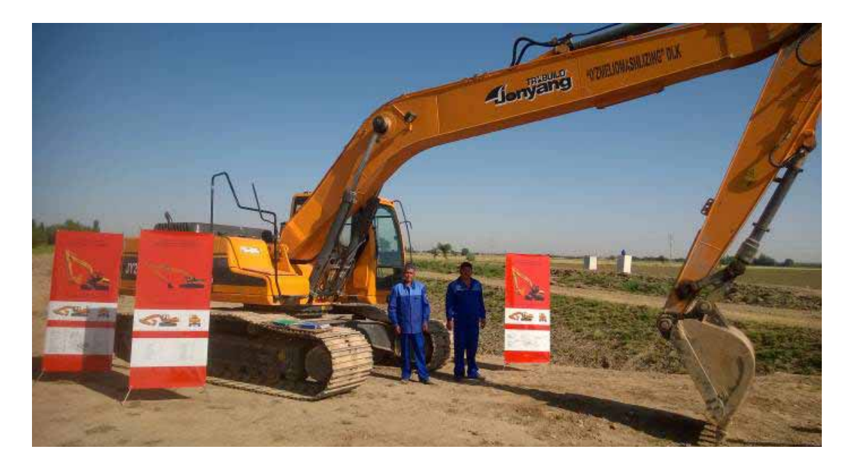
Presentation of equipment purchased by "Uzmeliomashlizing" under the Reclamation Fund

During the next stop the participants were introduced with equipment, which is produced and sold by the "Uzmeliomashlizing" company, which was specially established under the Reclamation Fund. Samples of technical equipment were presented with demonstration of their technical characteristics, price and purchase terms.