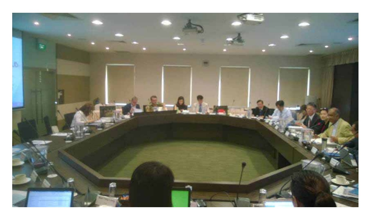
Working moments of the 17th Governing Council Meeting of the Asia-Pacific Water Forum (APWF) in Singapore