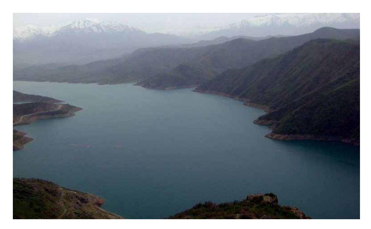
HEPS dam forms the Gissarak reservoir for seasonal flow regulation with the total volume of 170 Mm^3 and available capacity of 162 Mm^3