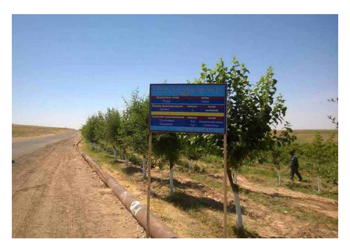
Water is life. The photo shows dead steppe to the left of the road and blossoming garden to the right, where water was delivered artificially

The participants of the seminar visited the Mirishkor Canal Authority. The functioning management information system for water allocation along the canal (developed in 2010-2011 by the "RESP-2" project with the assistance of SIC ICWC) was demonstrated.