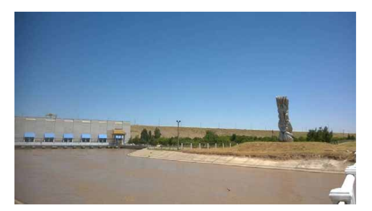
Pumping station № 7 at the Karshi main canal. The dam of the Talimarjan reservoir can be seen upstream

In the afternoon the participants left the south-west of the Kashkadarya province to the north-west – to Gissarak the hydroscheme. In the Nishan district the participants visited the demonstration plot with hydrometric equipment, which is used to train farmers in water accounting. In addition, the experiment of cotton alternate furrow irrigation under black film was shown. This technology allows reducing irrigation norm by 40% and increasing crop yield by 25%.