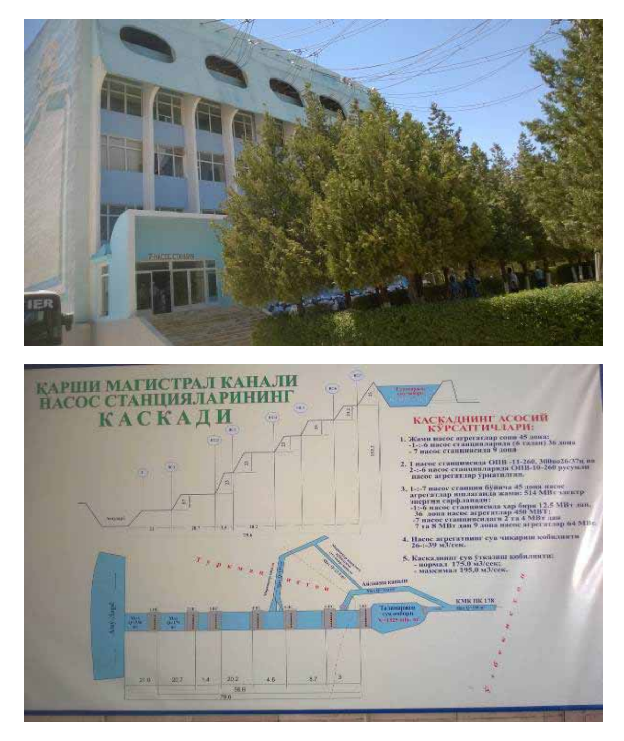
Pumping station № 7 at the Karshi main canal.