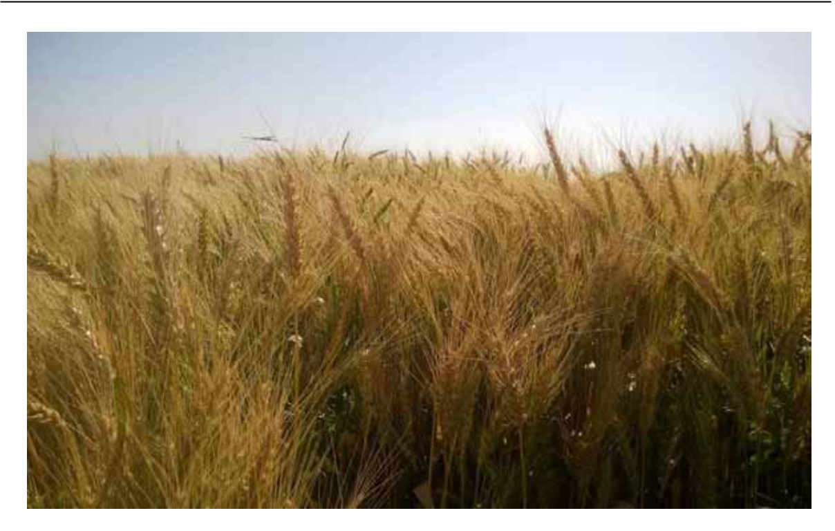
Wheat in Kashkadarya

The participants visited the Kamashin reservoir, where they became acquainted with operation of the set of facilities, as well as fish production in special ponds.