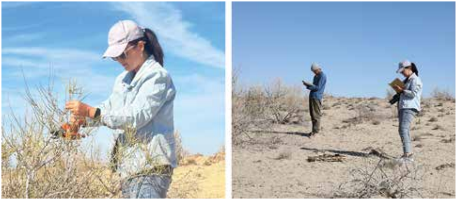
Figure 5: Collecting Desert Plant Samples.