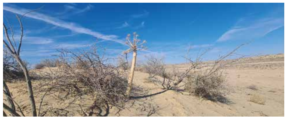
Figure 12: Consolidation of sand dunes.

About 500 thousand hectares of forest reclamation works<sup>7</sup> were carried out under the "Yashyl qoplama" program. Manual and mechanical sowing of saxaul and tamarisk on sandy and sandy loam soil with coquina and small knobbly dunes was carried out. The states of plants are in good condition.