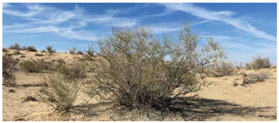
Figure 7: Kandym plant.

conditions by representatives of psammophilic plants<sup>₄</sup> – plants of shifting sands with a developed root system that ensures high survival.