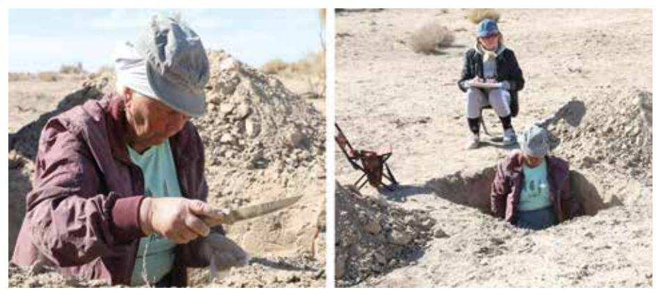
Figure 14: Process of soil transects.