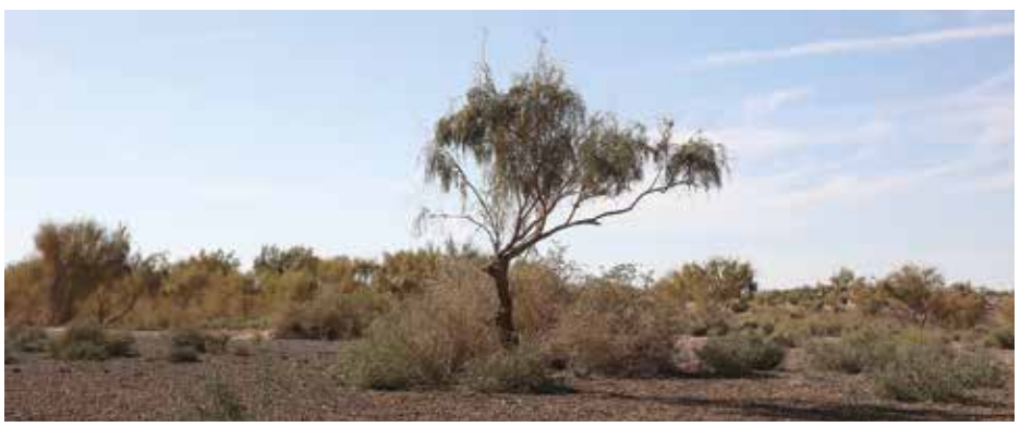
Figure 13: Black saxaul.