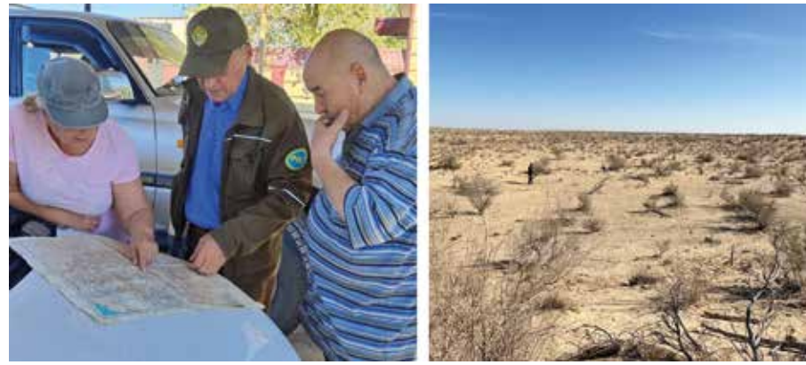
Figure 2: Review of expedition routes.