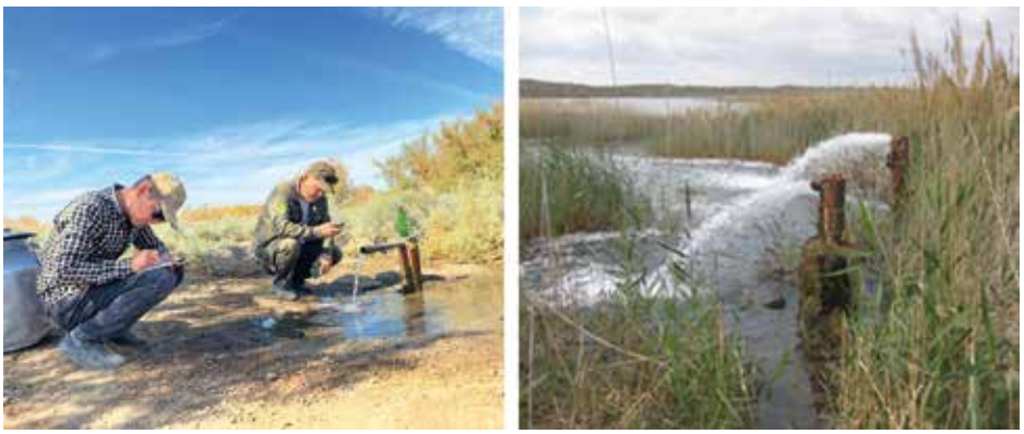
Figure 8: Measuring groundwater conditions.