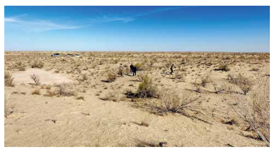
Figure 1: Overview of the dried bottom of the Aral Sea, 4th expedition.

In addition, monitoring will allow to identify surface transformation, exclude (or add) areas subject to radical improvement of natural