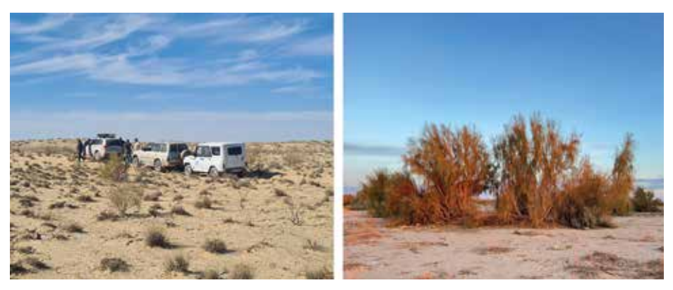
Figure 10: Stop to describe the area.