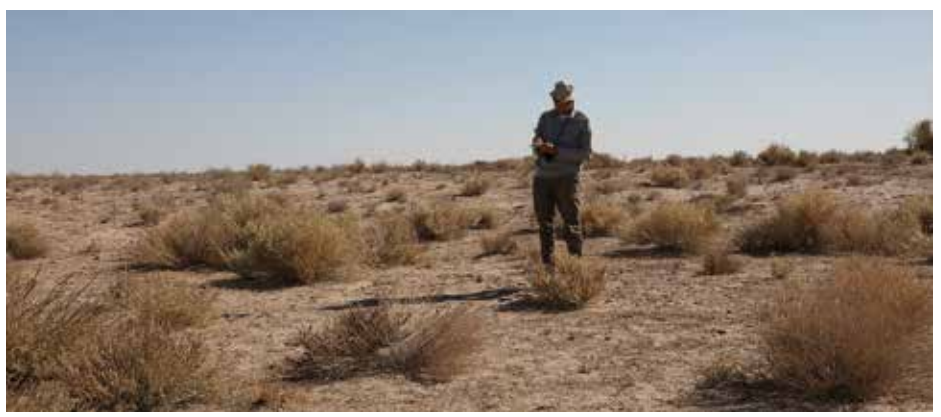
Figure 16: Study of landscape changes on a drained seabed.