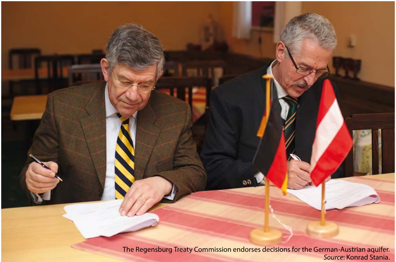
The Regensburg Treaty Commission endorses decisions for the German-Austrian aquifer.

contain a rather brief provision on the institutional cooperation between the aquifer States. The principal reason for this pattern is that the present model provisions will, in most of the cases, either be inserted in an agreement on surface waters or supplement that agreement in the form of a Protocol. Such an agreement will normally provide for the establishment of a joint body for cooperation on transboundary surface waters. The latter should also be entrusted to deal, either directly or through a subsidiary organ such as a subcommittee or a working group, with related groundwaters, so as to facilitate the integrated management of both surface