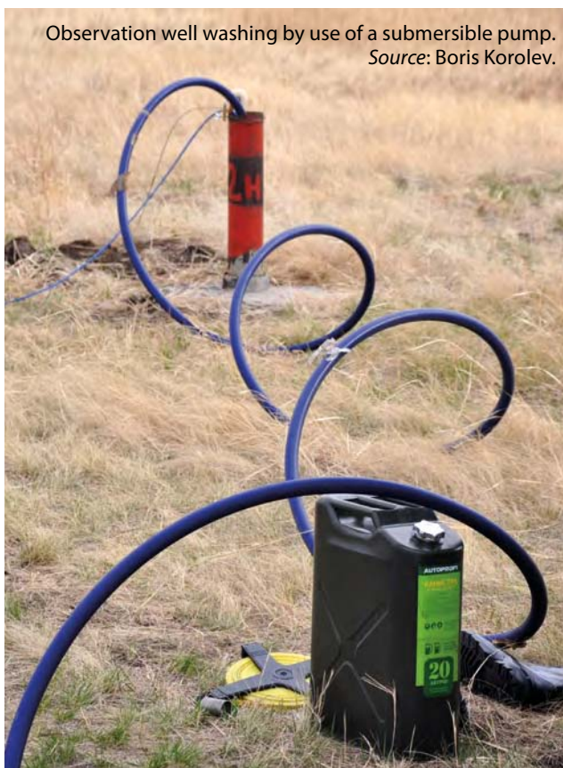
Observation well washing by use of a submersible pump.

1. Article 3, paragraph 1 (h), of the Water Convention requires the Parties to ensure that environmental impact assessment (EIA) and other means of assessment are applied. In addition, article 15 of the ILC Draft Articles obliges the aquifer State to assess, notify and consult with the other aquifer State, if it has grounds to believe that a particular planned activity in its territory may affect a transboundary aquifer and hence have a significant adverse effect upon that State. Detailed provisions in this regard are contained in Part III (articles 11–19) of the 1997 International Watercourses Convention, as well as in articles 9 to 11 of the Guarani Aquifer Agreement.