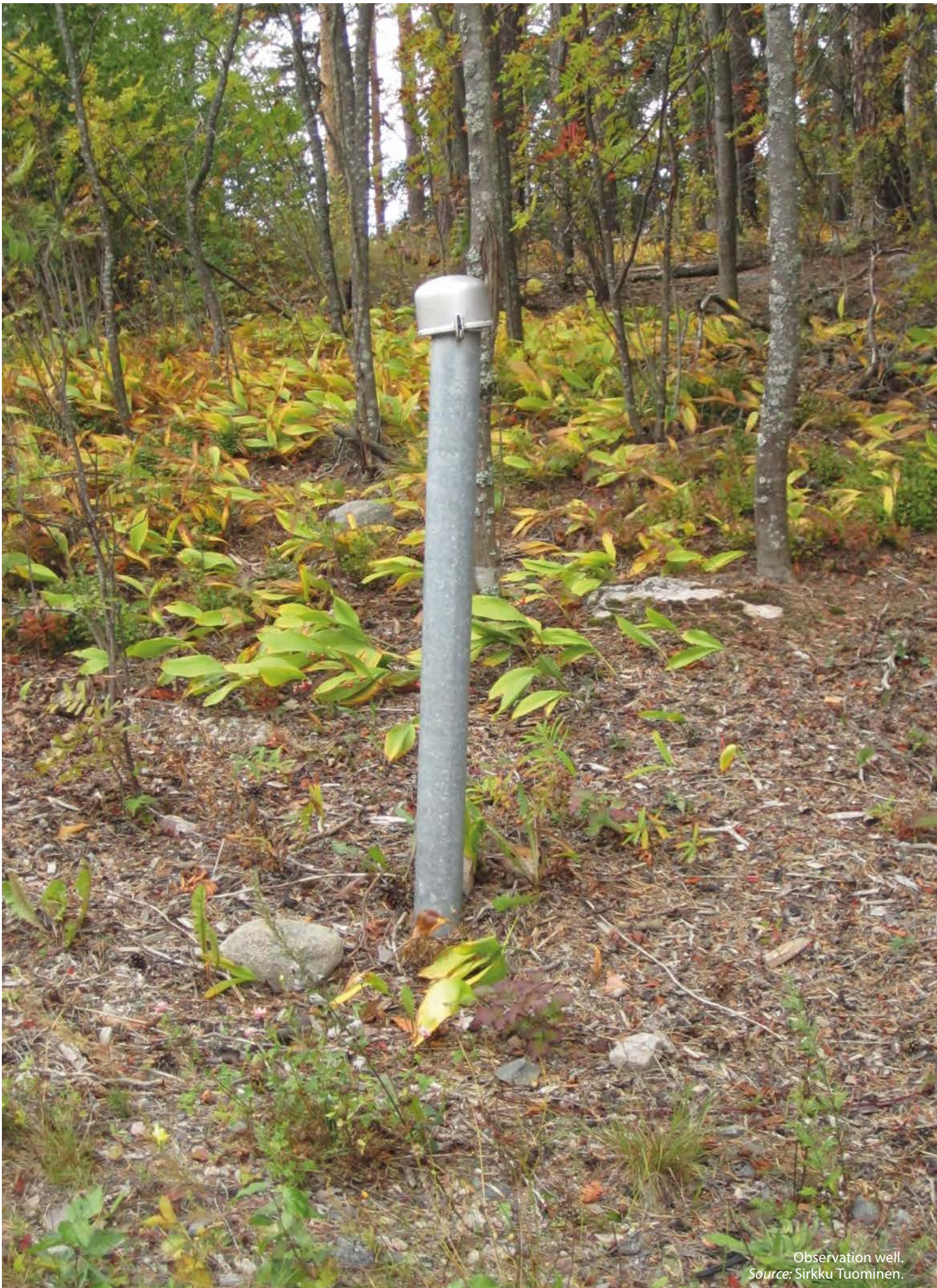
Observation well.