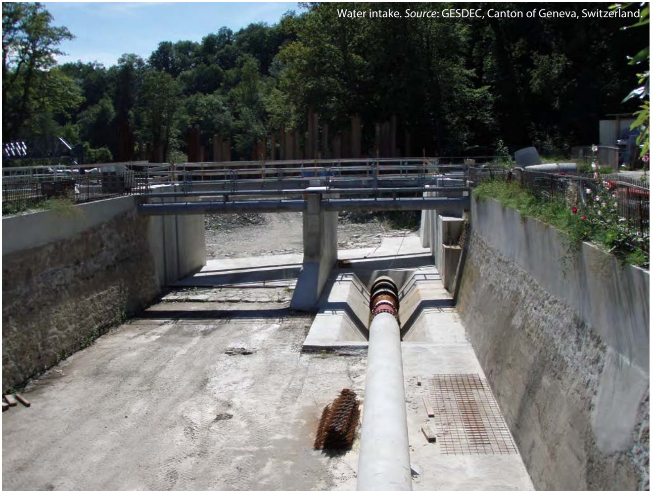
Water intake.

3. The sustainability principle is formulated in paragraph 1 in flexible terms, as it applies to groundwaters in a differentiated manner. Namely, in case of recharging aquifers, its aim is to preserve renewable resources, while in the case of non-recharging aquifers, its object is to maintain non-renewable resources to the maximum extent reasonably possible. 15 However, as far as water quality is concerned, compliance with the sustainability principle may require greater protection for groundwater as compared with surface waters because of the greater technical difficulty and higher cost of its remediation.