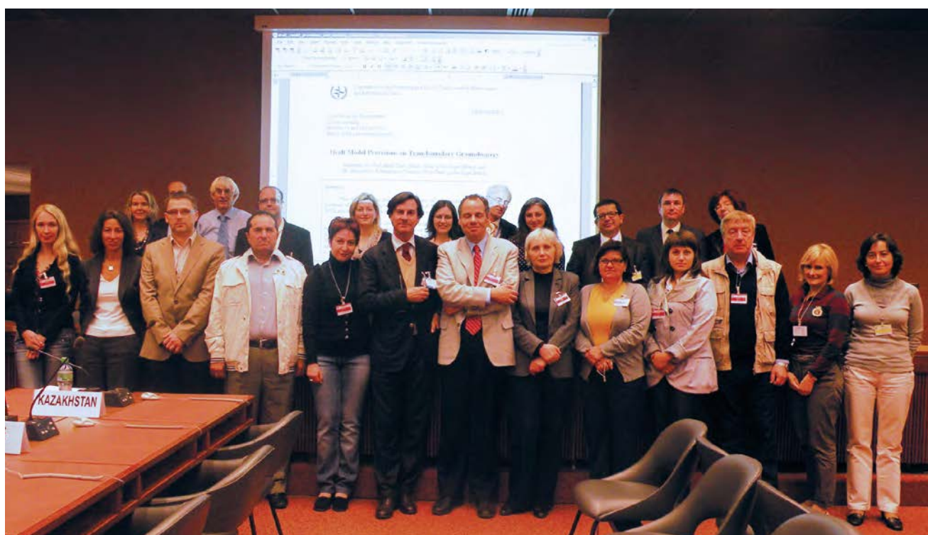
Core Group on Groundwater, June 2012.