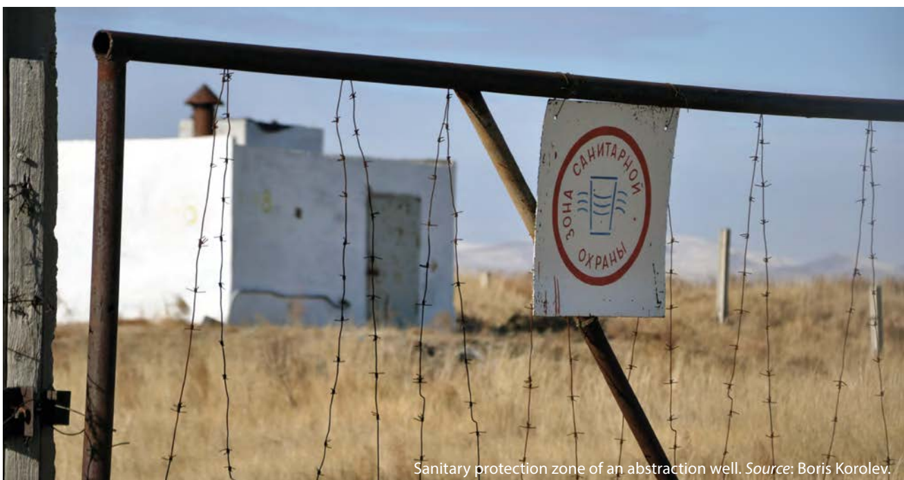
Sanitary protection zone of an abstraction well.