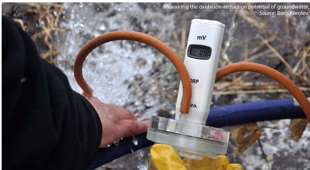
Measuring the oxidation-reduction potential of groundwater.

2. The sustainable use of transboundary groundwaters is closely linked to their equitable and reasonable utilization. In fact, the management of transboundary waters in such a way as to jeopardize their preservation would not be equitable and reasonable for the purposes of international water law. The principle of equitable and reasonable utilization, through its association with the principle of sustainable development, acquires a prospective dimension, ensuring not only actual equity among the aquifer States, but also equity among present and future generations. In assessing whether a certain utilization of transboundary waters is of an equitable character, the aquifer States should take into account the imperatives of conservation, environmental protection and future availability of waters, and not limit themselves to considering whether the planned utilization allows for an optimal use of the waters from a purely short-term economic point of view.