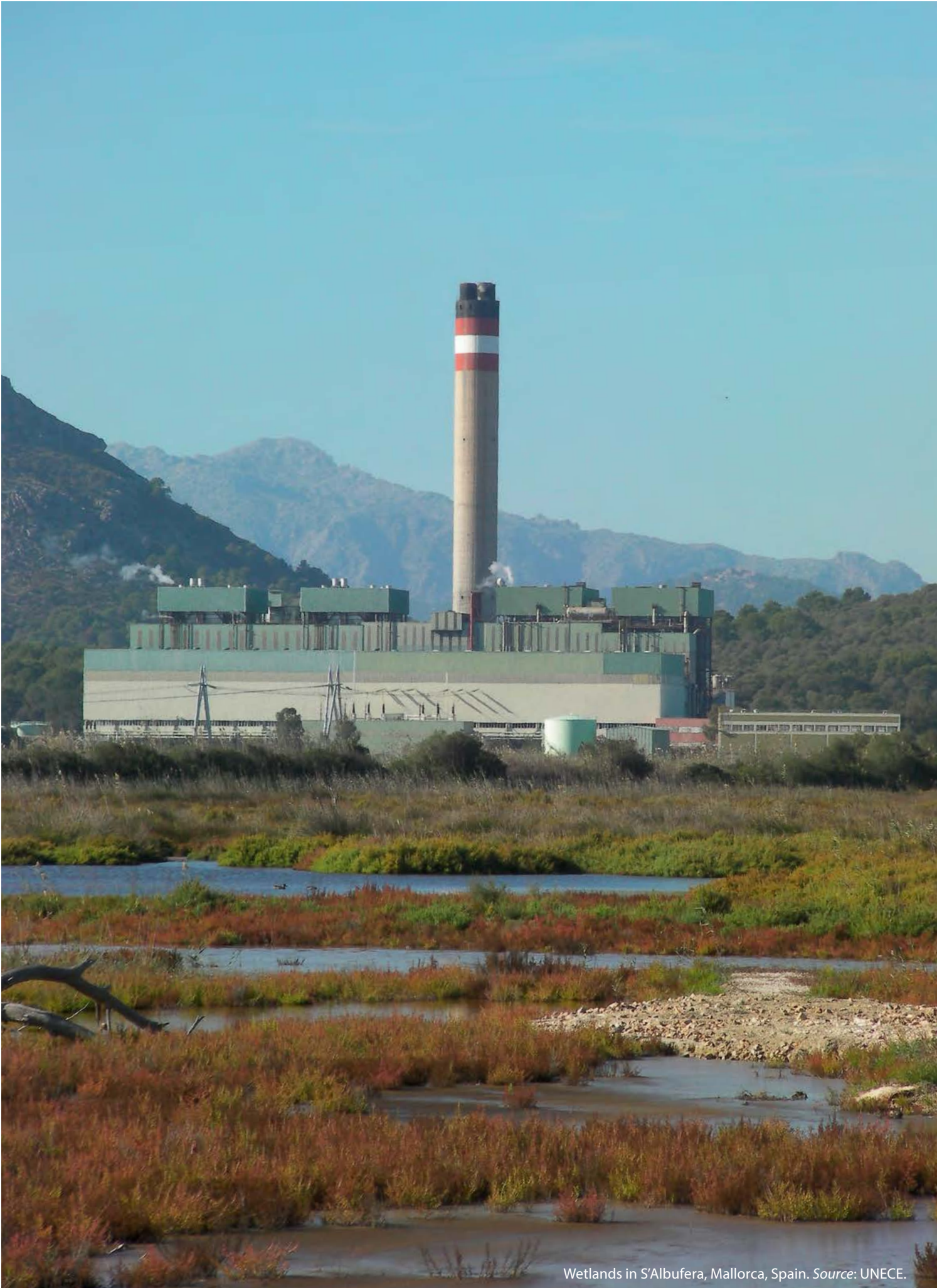
Wetlands in S'Albufera, Mallorca, Spain.