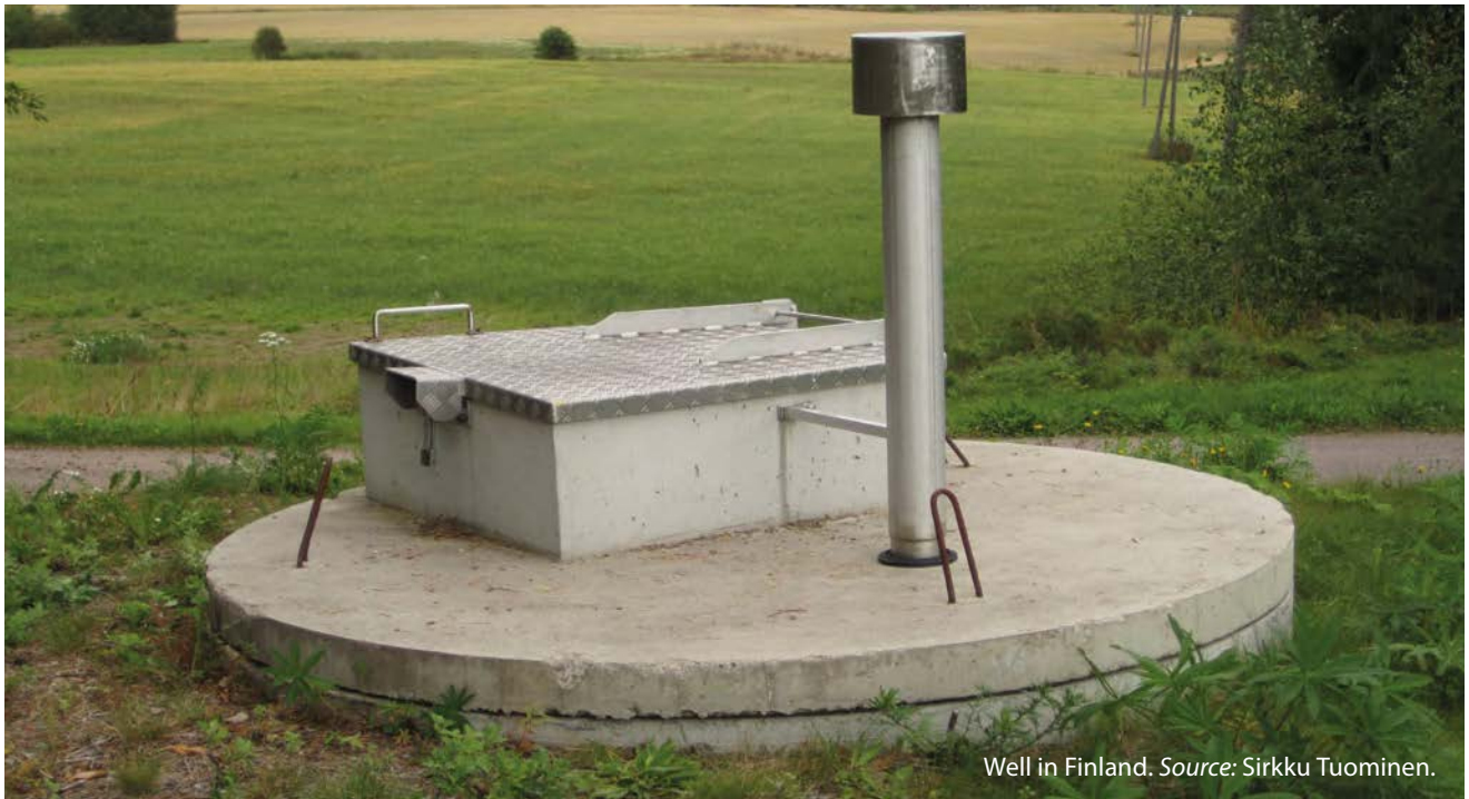
Well in Finland.

and no hierarchy is established among them, as it is for the Parties to jointly assess the status and the particular needs of each transboundary aquifer and fix the priorities accordingly. For instance, measures for combating point sources of pollution or current diffuse pollution usually differ from those adopted in cases of historical contamination. In the latter case, the appropriate measures might include remediation, if feasible, or other management options such as prohibiting water abstraction for drinking water supply or establishing pumping barriers.