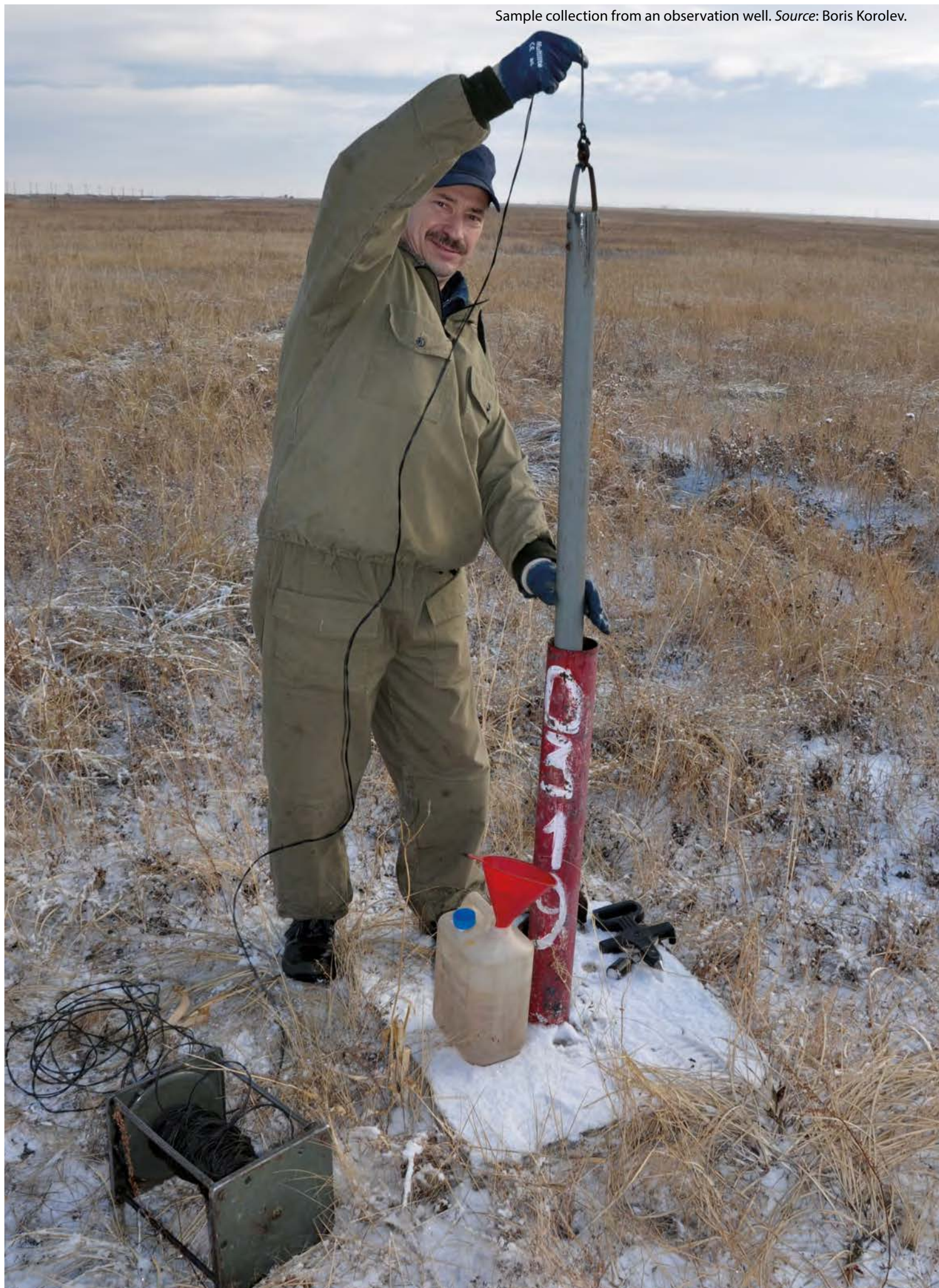
Sample collection from an observation well.