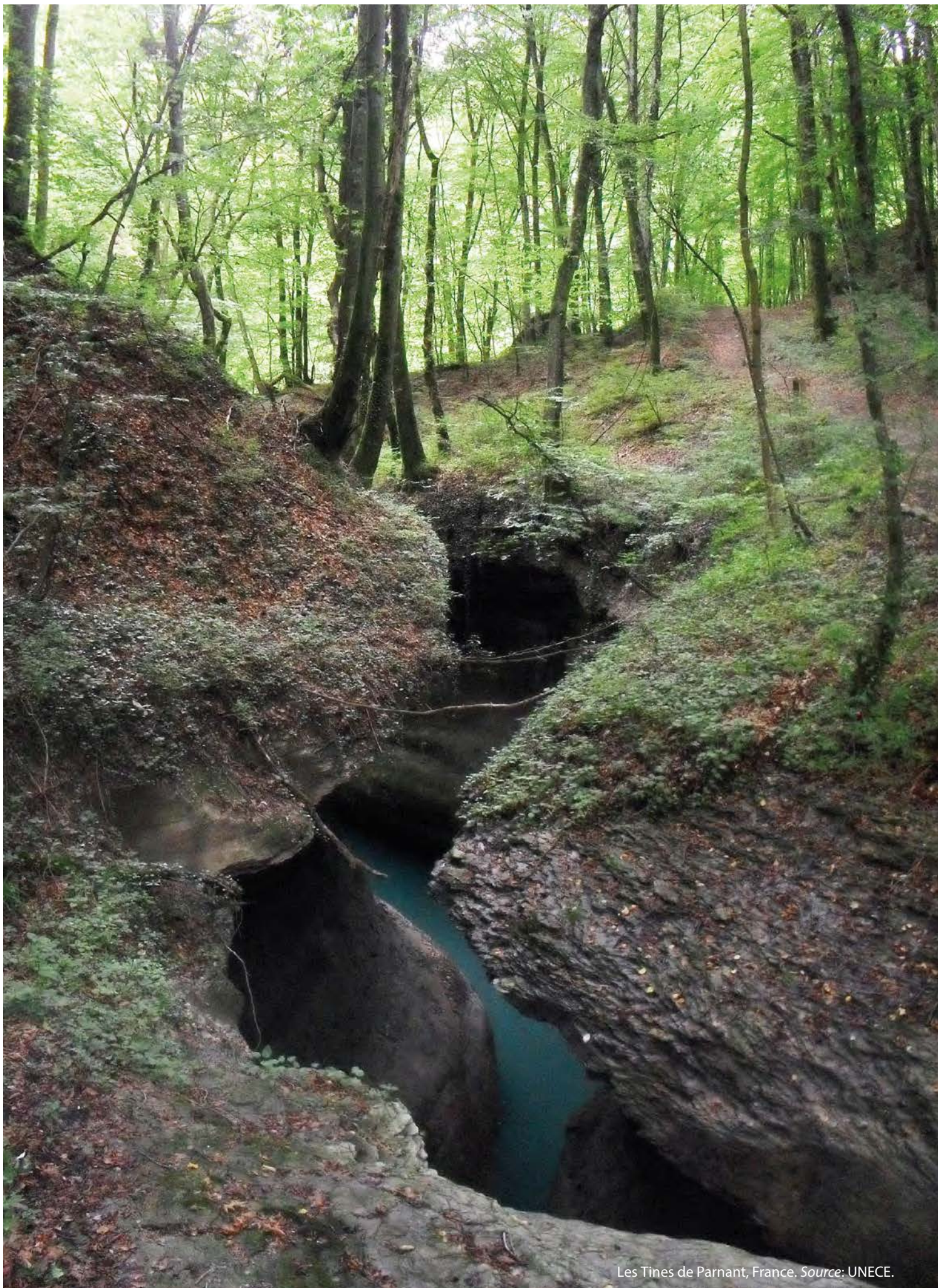
Les Tines de Parnant, France.