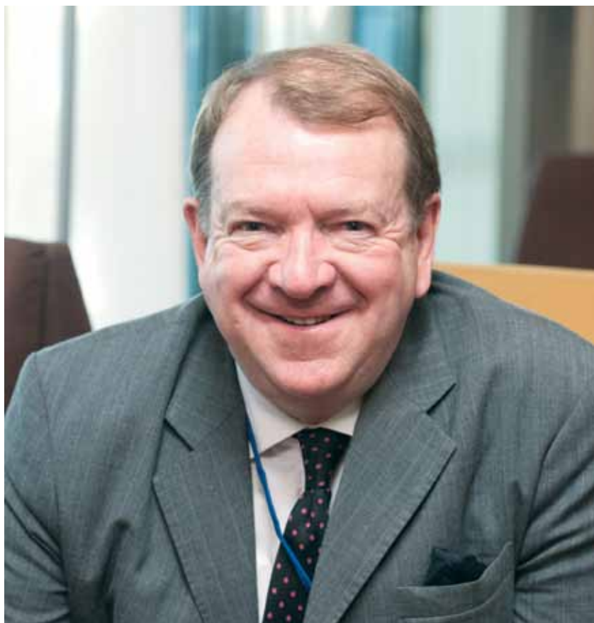
Struan Stevenson, Member of the European Parliament from the Scottish Conservative Party, the personal representative of the OSCE Chairman in Ecology and the Environment