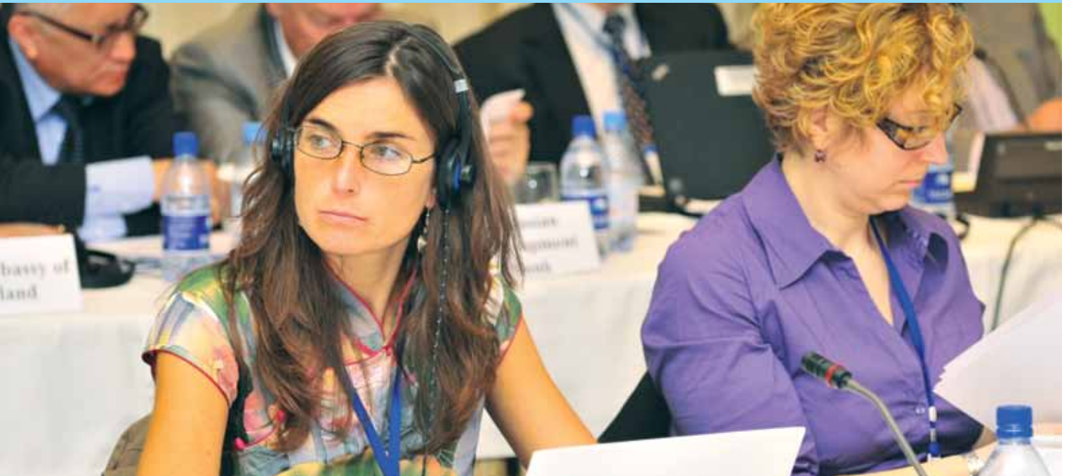
The Donors' conference in Almaty, May 20, 2010

The Joint Statement of the Heads of the founder-states of the International Fund for saving the Aral Sea emphasized the great importance of the necessity of broad cooperation with UN agencies, including the Economic Commission for Europe (UNECE), the Economic and Social Commission for Asia and the Pacific (UNESCAP), the United Nations Regional Centre for Preventive Diplomacy for Central Asia (UNRCCA) and other organizations.