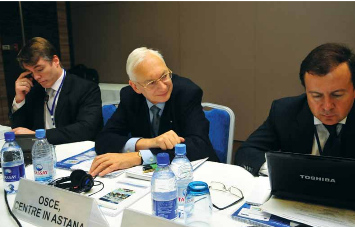
Representatives of international organizations on the Coordinating Conference of Donors for the Third Aral Sea Basin Program, Almaty, December 9, 2010.

International Water Assessment Centre (IOWater) “Capacity building in data administration for assessing transboundary water resources in Eastern Europe, Caucasus and Central Asia (EECCA)” (Pilot area - the Aral Sea) is undergoing. The UNECE is also part of the project. On 25-26 May 2011, the FFEM had organized a Workshop for the Kazakh users of the final product of the project, the information database.