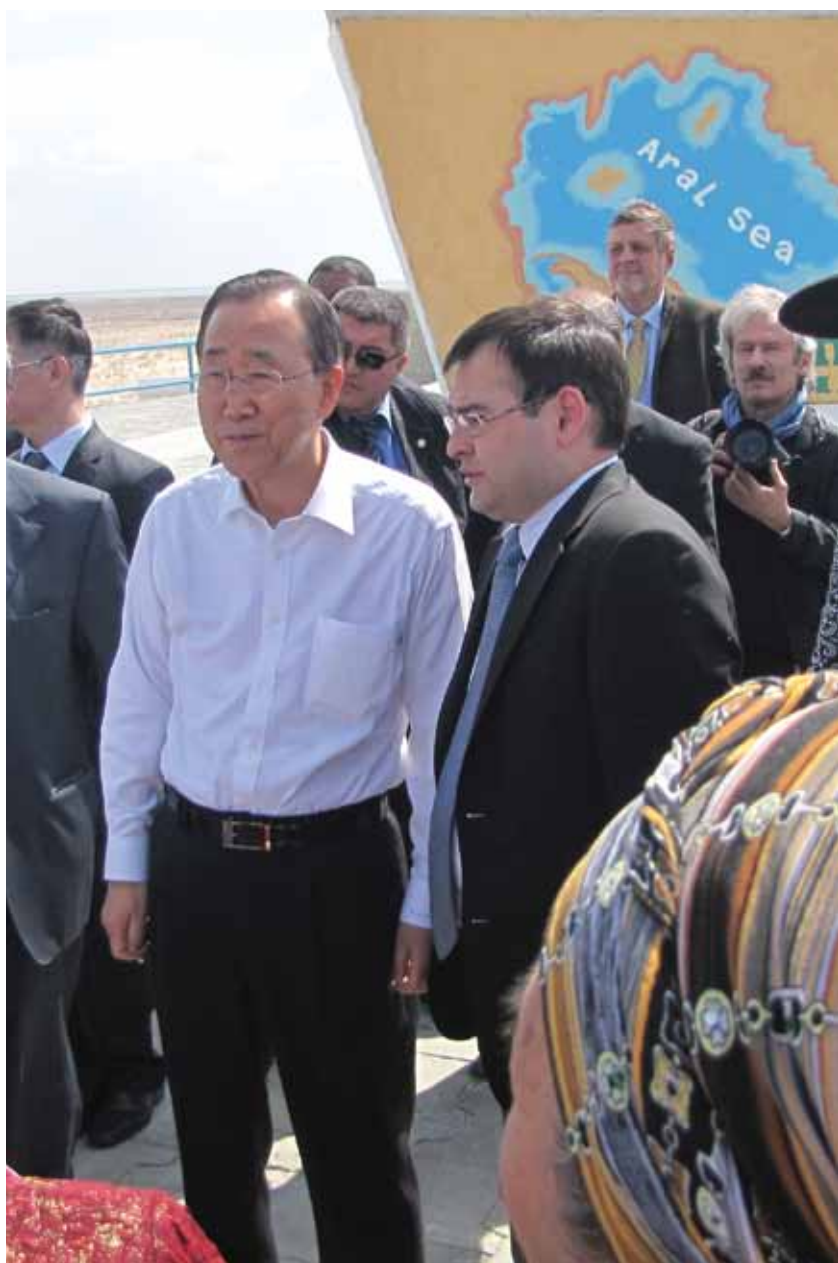
UN Secretary General Mr. Ban Ki-moon, Muynak, April 4, 2010.