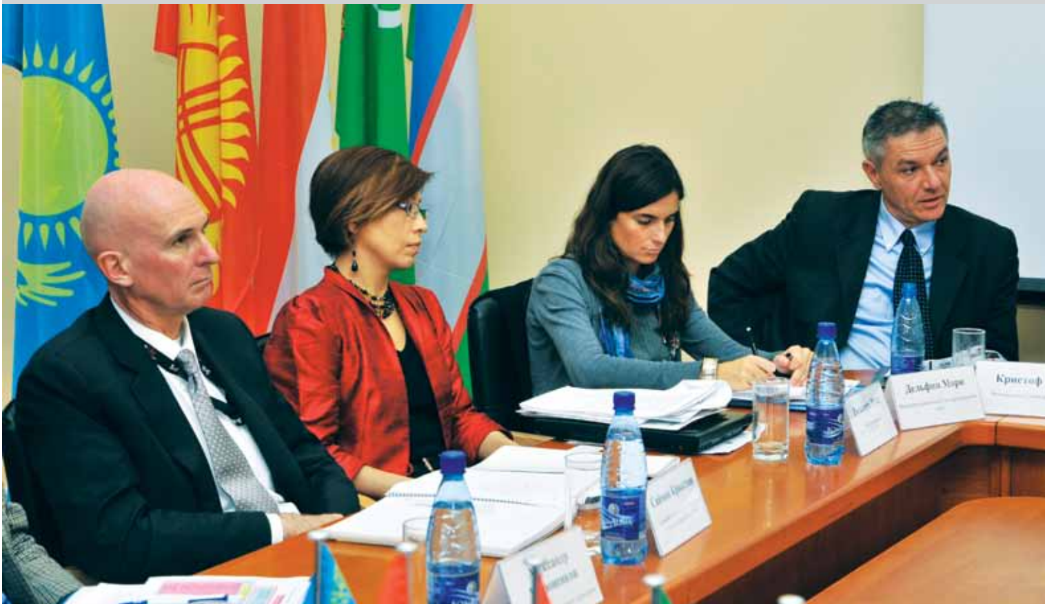
Representatives of the World Bank, UNECE and the European Commission at the Executive Committee of IFAS

Currently, the second phase of work of the expert and consultative group of donors, studied the proposals