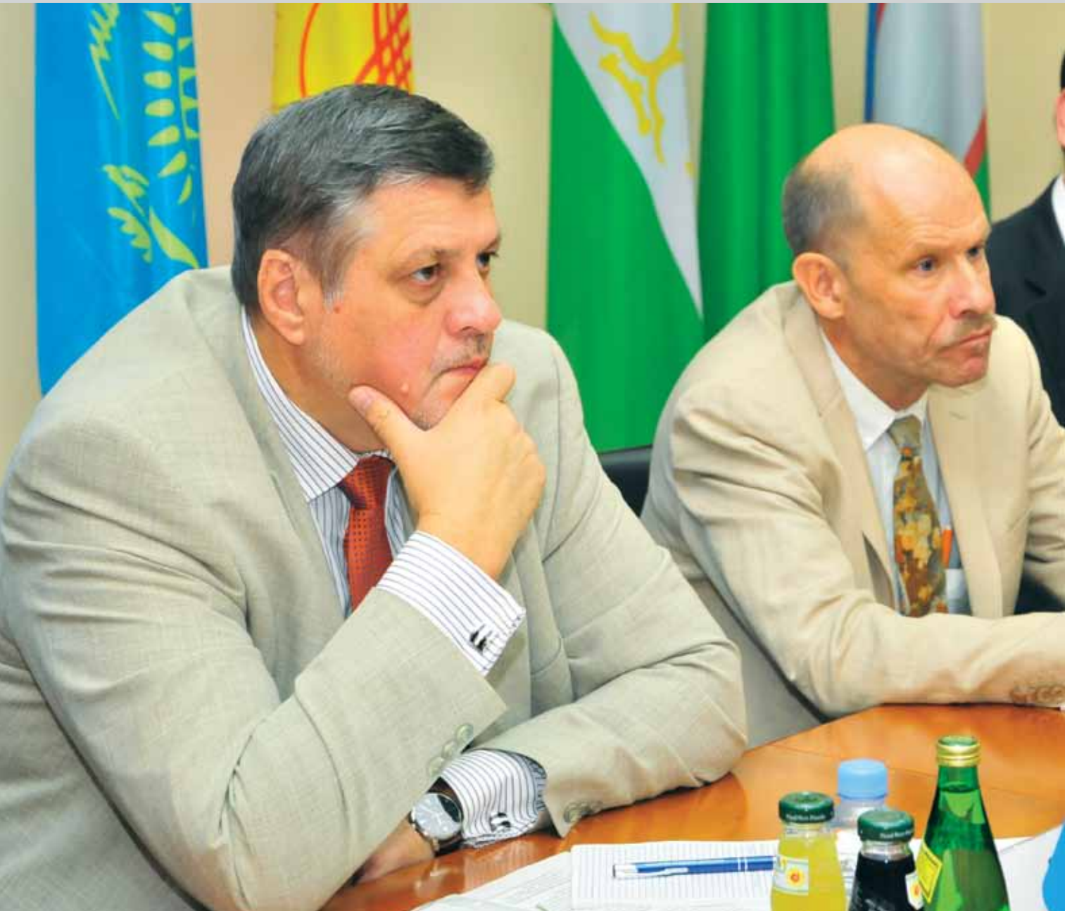
Ján Kubiš, UN Deputy Secretary-General, The Executive Secretary of the United Nations Economic Commission for Europe

One important result of interaction of IFAS with the UN agencies was the visit of the UN Secretary General, Mr. Ban Ki-Moon, to the Central Asian countries, including Kazakhstan. The UN Secretary-General noted that the responsibility for the Aral Sea disaster rested not only on the peoples of Central Asia, but on the entire world. He praised the work of IFAS, which was established at the initiative of the Heads of the Central Asian states. It was noted that Kazakhstan had the right to become the leader of international efforts to address the problems of the Aral Sea basin, to exert all necessary efforts for restoring the ecology in the region. The Secretary-General noted that the main task was to stop further degradation of the Aral Sea: "This problem must be shared by the region and the world community. On our part, we will try to involve all UN agencies and organizations that are relevant to such issues so that they can provide maximum assistance".