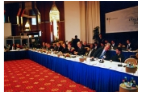
Ministers from all over the world adopted the Ministerial Declaration during the Ministerial Session on 4th December 2001.

Water development programmes, to be successful, should be based on a good understanding of the negative impact desertification causes to people living in affected areas.