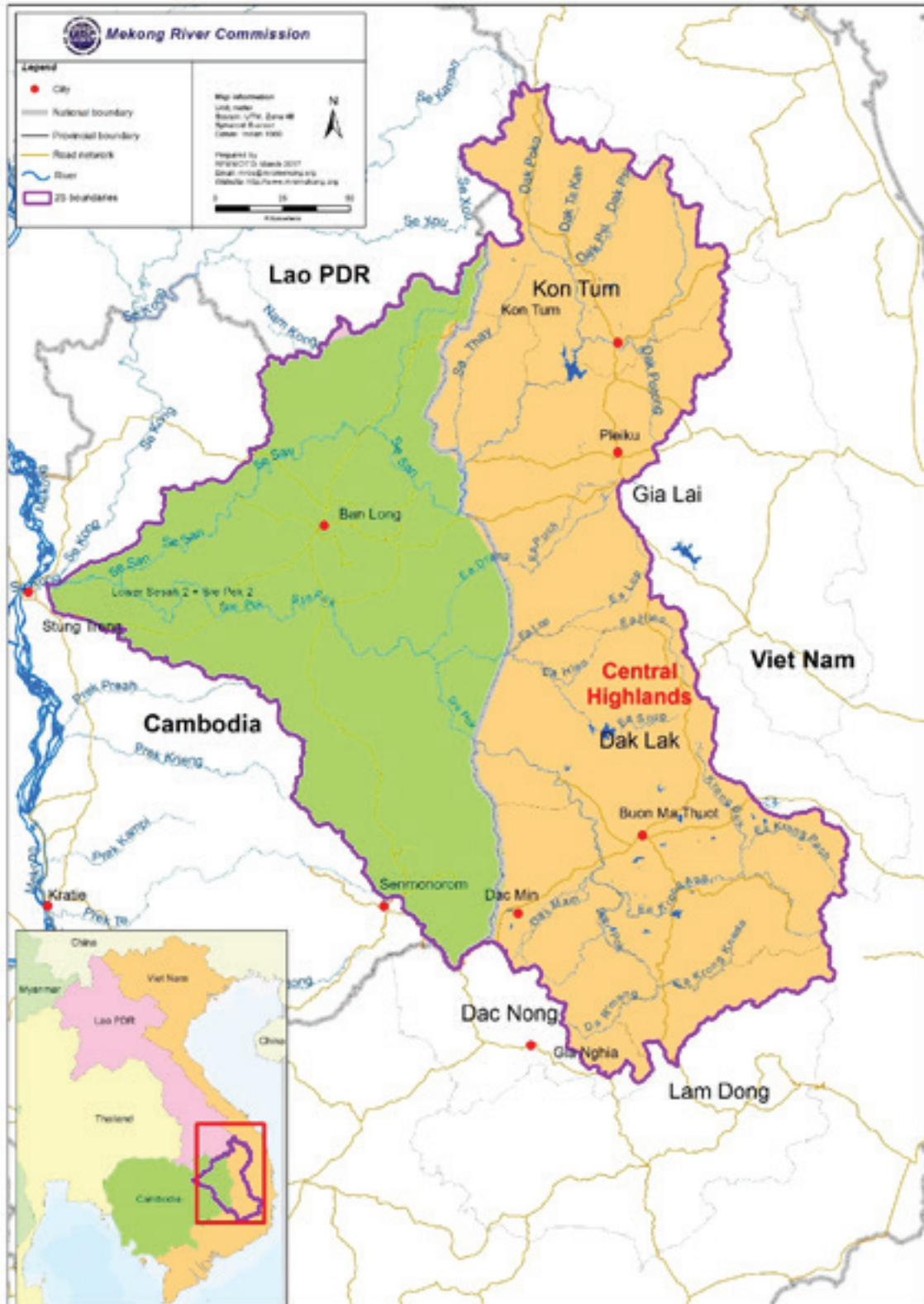
Figure 1: Administrative and Hydrological Boundaries of the Sesan and Srepok Project Area