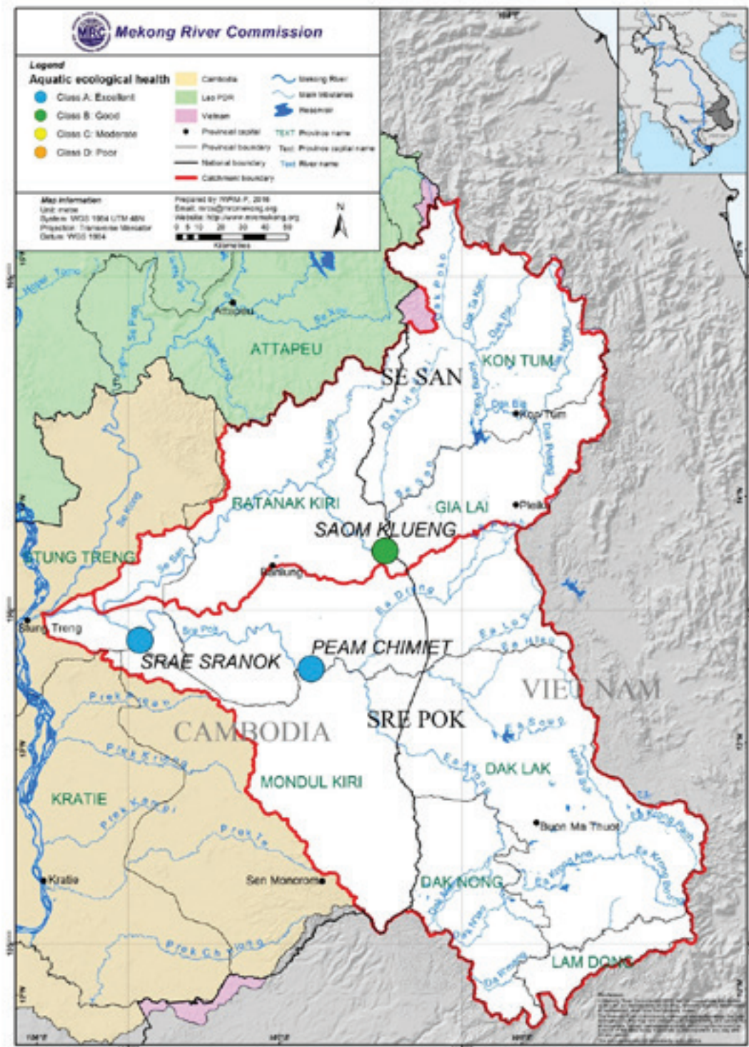
Figure 7: Aquatic Ecological Health Sites in the Sesan and Srepok River Basins 5