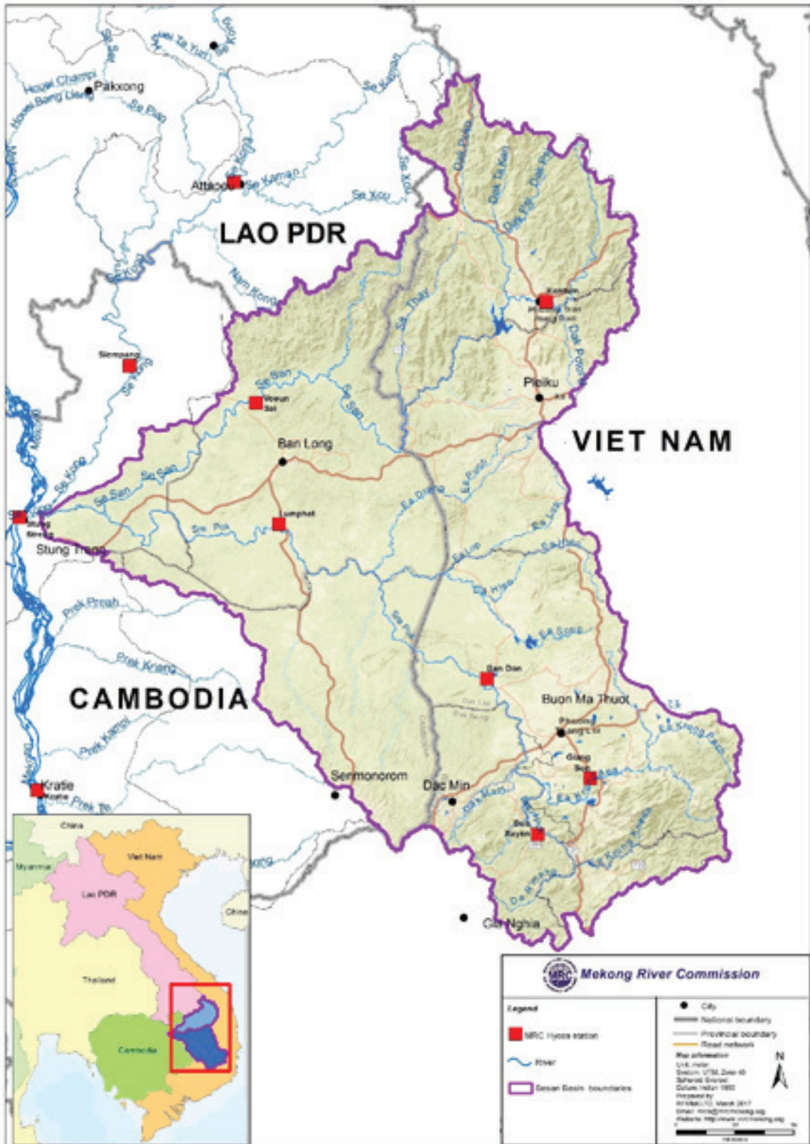
Figure 6: MRC Hycos Stations in the Sesan and Srepok River Basins