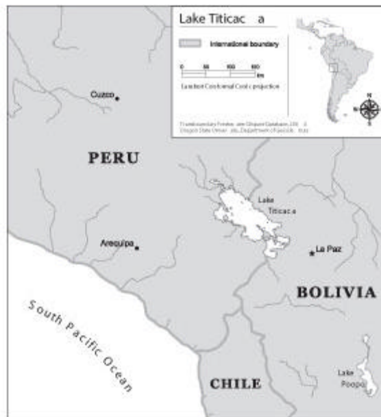
Figure 1: Map of Lake Titicaca (size: 111,800 km 2 (TFDD, 2007)).