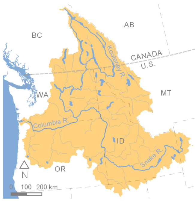
Fig. 1. Map of the Columbia River basin. Created by Hailey Eckstrand, 2017.

The Columbia River Treaty (the Treaty or CRT), which has governed the Columbia River since 1964, was negotiated between the Canadian and U.S. governments to reduce flood risk and optimize hydropower generation. A 1963 agreement between the Province of British Columbia (BC) and the Government of Canada gave most of the rights, obligations, and benefits of the Treaty to the province (Cosens and Williams 2012). The Treaty Entities tasked with implementing the CRT are BC Hydro for Canada and the Bonneville Power Administration and the U.S. Army Corps of Engineers in the United States. Flood control provisions are set to expire in 2024, and certain elements of the Treaty have been identified as up for renegotiation (e.g., Canadian entitlements). Between 2011 and 2013, Treaty Entities on both sides of the border have engaged in public consultation and a multiphase review process with the goal of informing the renegotiations, which formally began 29 May 2018. The review has provided an opportunity for historical injustices to be voiced and for First Nations (the term used for Indigenous peoples in the Canadian portion of the basin) and Tribes (the term used for Indigenous peoples in the U.S. portion) to engage in nation-to-nation discussions with state, provincial, and federal governments.