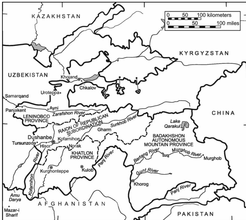
Figure 1. Map of Tajikistan.