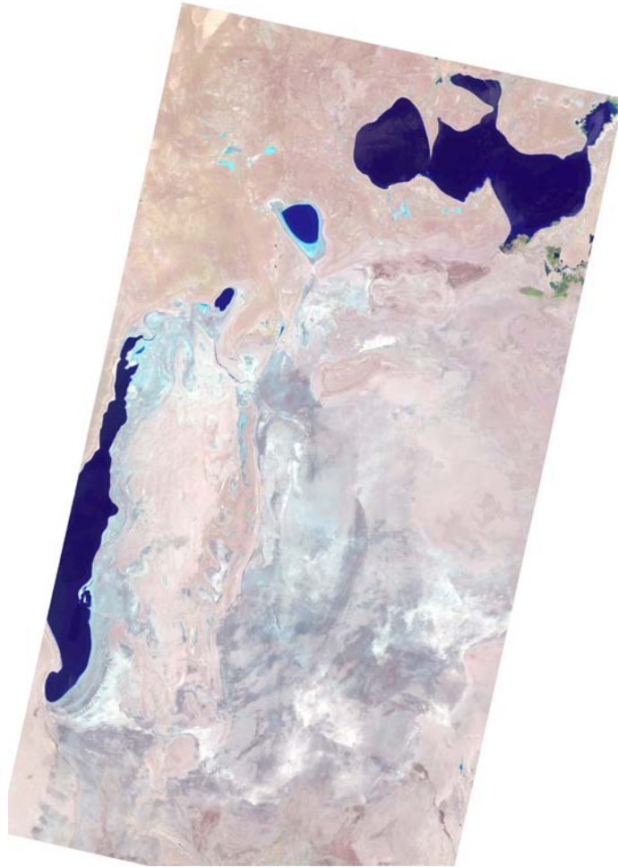
Figure 1 Southern part of the Aral Sea Landsat 8-9, 6 June 2024

SIC specialists are constantly monitoring the state of the Southern Aral Sea and parts of the Greater Aral Sea by using the Landsat 8-9 OLI images. The use of the NDVI index with refined threshold values has been started, which allow recognizing three categories of surfaces: 1) open water surface, 2) wetlands, 3) land. According to the image from 6 June 2024, the areas of wetlands and open water surface were determined