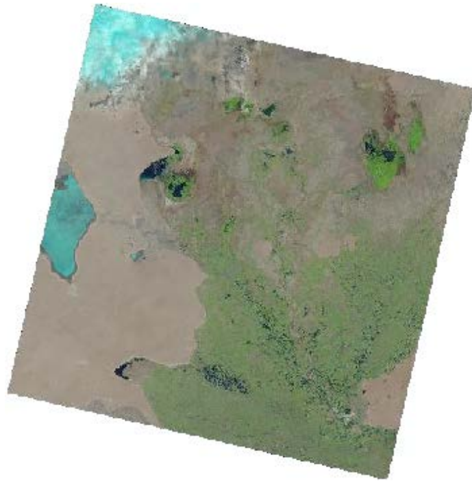
Figure 2 The Aral Region. Landsat 8, 13 June 2021.