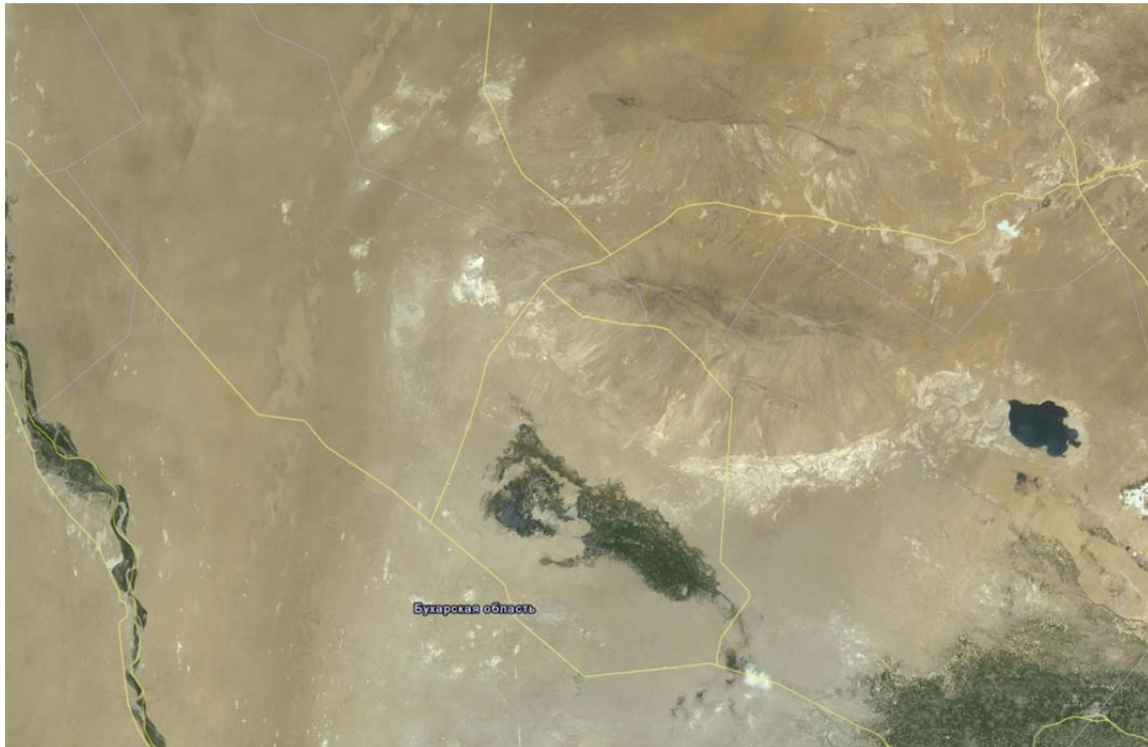
Figure1. Sample of the local salt collectors in the Bukhara region

The changed geopolitical, water management and institutional conditions, technical technological capabilities and ecological imperatives require a considerable modernization of the initial plan. First of all, it is connected with the route of a collector: it must be in the borders of Uzbekistan. Not less important: it needs to be laid to the western deep-water residual reservoir, the Aral Sea. In the upgraded version of the right-bank collector, it is offered to support the essential level of its fish capacity and, generally, a biological productivity of the landscapes interfaced to it.