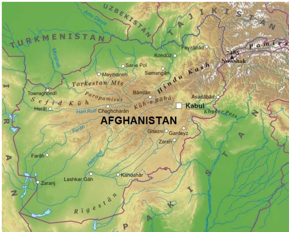
Figure 1. Afghanistan map and transboundary rivers

Afghanistan is an unlucky country that lacks the ability to develop its water resources. The existing water infrastructure has been destroyed during thirty years of war. This deficit in water management capacity exacts a heavy toll, exacerbating unemployment, food insecurity, water disputes, and the production of crops that can compete with illicit drugs. Without the means to store and divert water, existing infrastructure is vulnerable to devastating seasonal floods and droughts. Afghanistan also needs electricity, which only reaches 6 percent of its rural communities and 15 percent of its urban population. 5