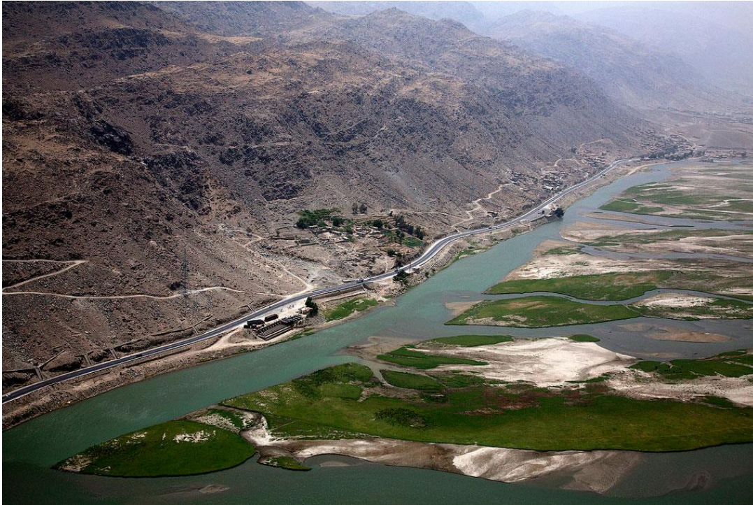
Photo 1. The Laghman River, one of Afghanistan's many waterways, is essential to agriculture and other development in this largely rural eastern province.

Keywords: Afghanistan's Transboundary Rivers, Regional Water Security, Hydro Politics of Afghanistan, Central Asia's Water, Central Asian Hydropolitics