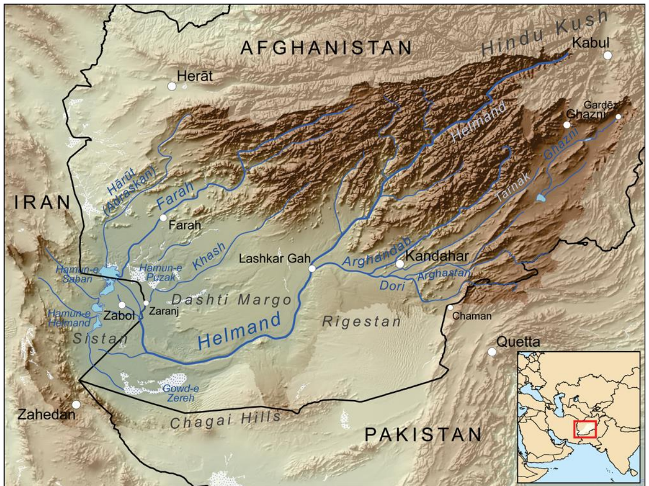
Figure 3 . Helmand River Basin

No bilateral or multilateral treaties have been signed on the Harirud and Murghab 9 .