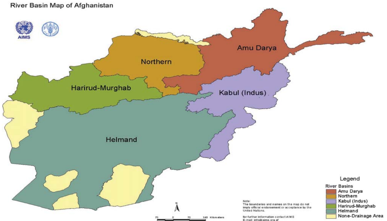
Fig. 1. Map of Five Major River Basins

At present, 70% of the urban population and 80% of the rural population have no access to potable water. Most people suffer from a shortage of water for domestic use. The efficiency of water supply systems in cities and rural areas is 50%, owing to the lack of maintenance and the shortage of power for their operation. In spite of the efforts of the government and international organizations,