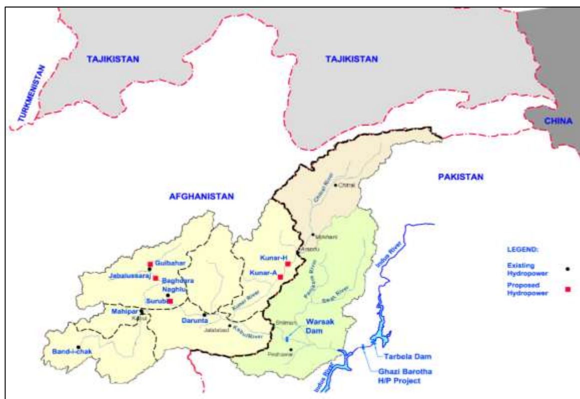
Figure 1. A location map of Kabul River Basin showing neighbouring countries.

The KRB is a complicated environment, affected by conflict and layered in a complex network of natural, social and political systems. The boundary between Afghanistan and Pakistan is porous; tribal groups, extended families, and insurgent factions live in both countries. Historical tribal relations complicate societal processes in the region. The Kunar River is the largest tributary of the Kabul River. The average annual flow of the Kabul River as it enters Pakistan is 22 billion cubic meters (BCM) (Mahmoudi 2017a). Almost 70 percent of the Kunar River flows originate in Pakistan territories. The winter season flow are 7 , 16 and 20 percent of the summer flow at three locations at the Kunar River as it enters Afghanistan (KA), as the Kunar River joins the Kabul River (KK), and as the Kabul River enters Pakistan (KP), respectively (World Bank 2016).