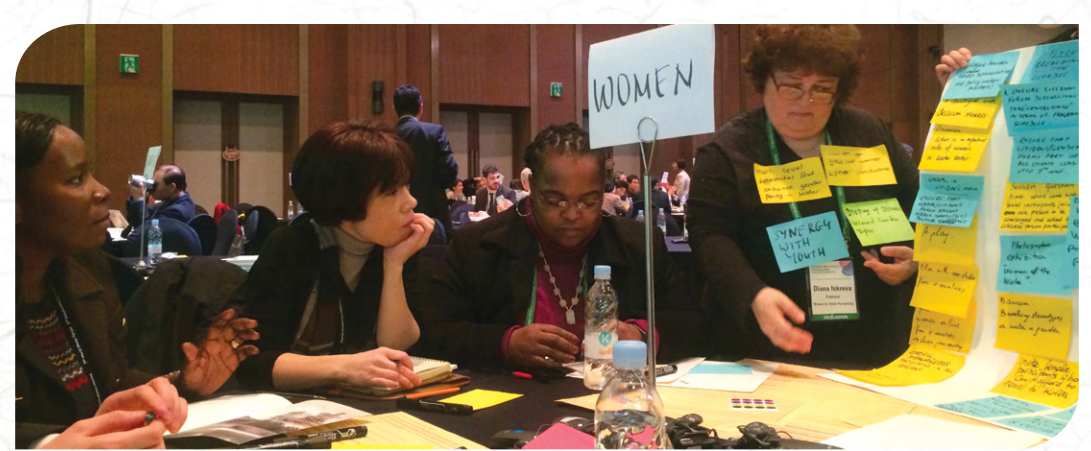
The Citizen's Forum Break-out Session of the SCM, Gyeongju, 28 February 2014

If you are a CSO with a water-related agenda, and want to create and execute your own program at the 7<sup>th</sup> World Water Forum, you are welcome to submit your own proposal. You can develop various types of activities that can serve to enrich the Forum's program, such as sessions, exhibitions, cultural performances, and lectures. If you need more guidance or want to submit your proposal, contact citizens7@worldwaterforum7.org