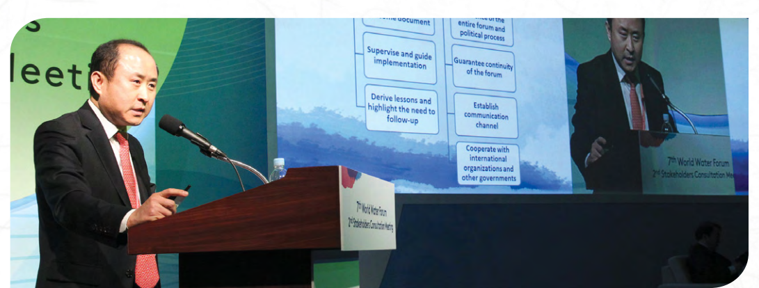
The Political Process Plenary Session of the SCM, Gyeongju, 27 February 2014

If you want to get involved, visit our Virtual Forum. http://eng.worldwaterforum7.org 'Virtual Forum', and share ideas and exemplary cases related to water.