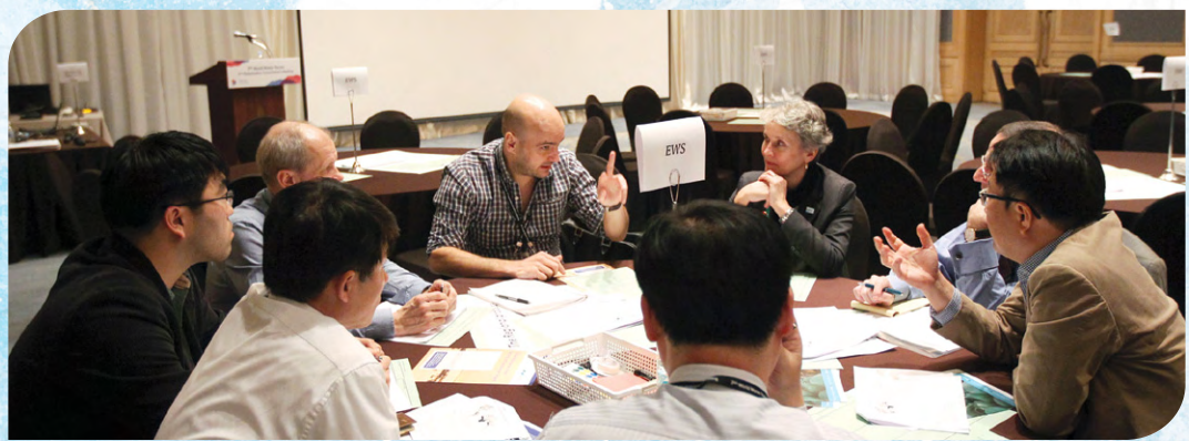
The Regional Process Break-out Session of the 2<sup>nd</sup> Stakeholder Consultation Meeting, Gyeongju, 27 February 2014

Your collaboration and contribution will make the 7th World Water Forum successful.