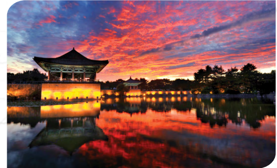
Sunset(Donggung and Wolji, the banquet hall of the Silla Dynasty)