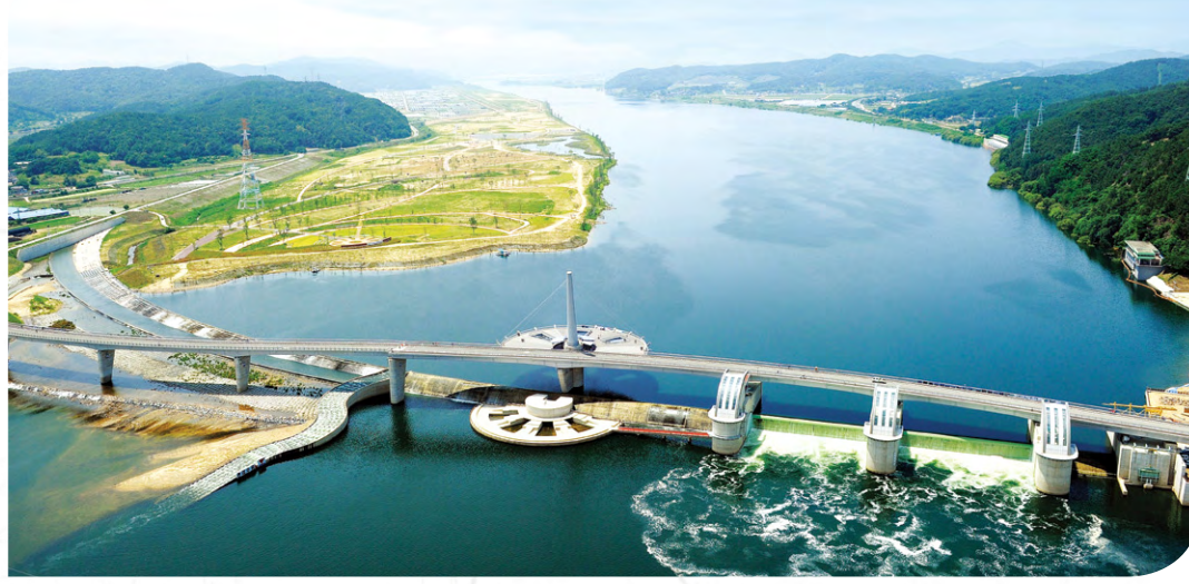
The Four Seasons of the Year, Daegu Summer(Gangjeong Goryeong Weir in the Nakdong River)

Daegu, with its population of around 2.5 million, is the third largest city of the Republic of Korea. The well-preserved ecosystems of the Nakdong and Geumho Rivers, and Shincheon stream that flow through the city are symbols of its accomplishments in sustainable development.