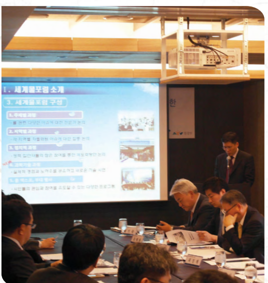
Meeting with water-related enterprises, 7 Apr. 2014