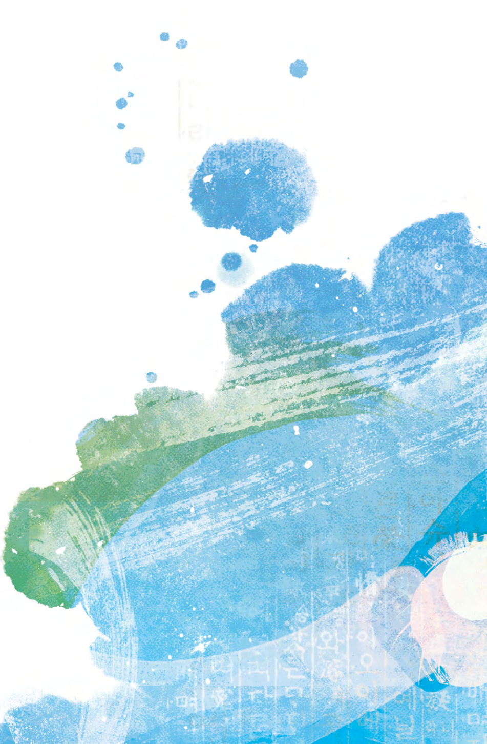
2<sup>nd</sup> Announcement June. 2014