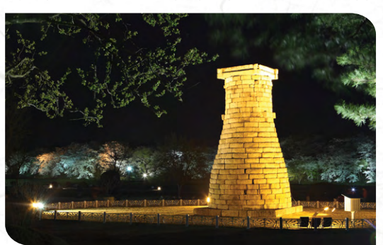
Night(Cheomseongdae, the orient's first observatory)