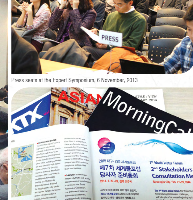
Media covering the 7th World Water Forum Kick-off Meeting, 13~15 May 2013 Advertisements on the SCM for the 7th World Water Forum, 27~28 February 2014