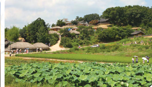
Daytime(Traditional Houses of Yangdong Village, UNESCO World Heritage)