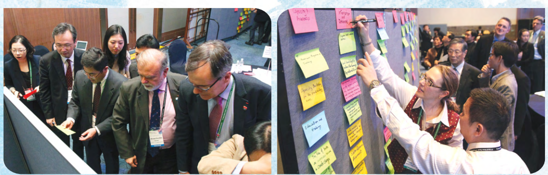
The Science & Technology Process Break-out Session of the SCM, Gyeongju, 28 February 2014

World Water Challenges will be a competition program for sustainable and innovative scientific and technological projects serving to bridge problem owners and solution providers. By sharing know-how and best practices, leading cases of water policies and strategies from both the public and private sector will be selected to form the basis of a coherent set of 'Policy-Economy-Technology-Practice' examples.